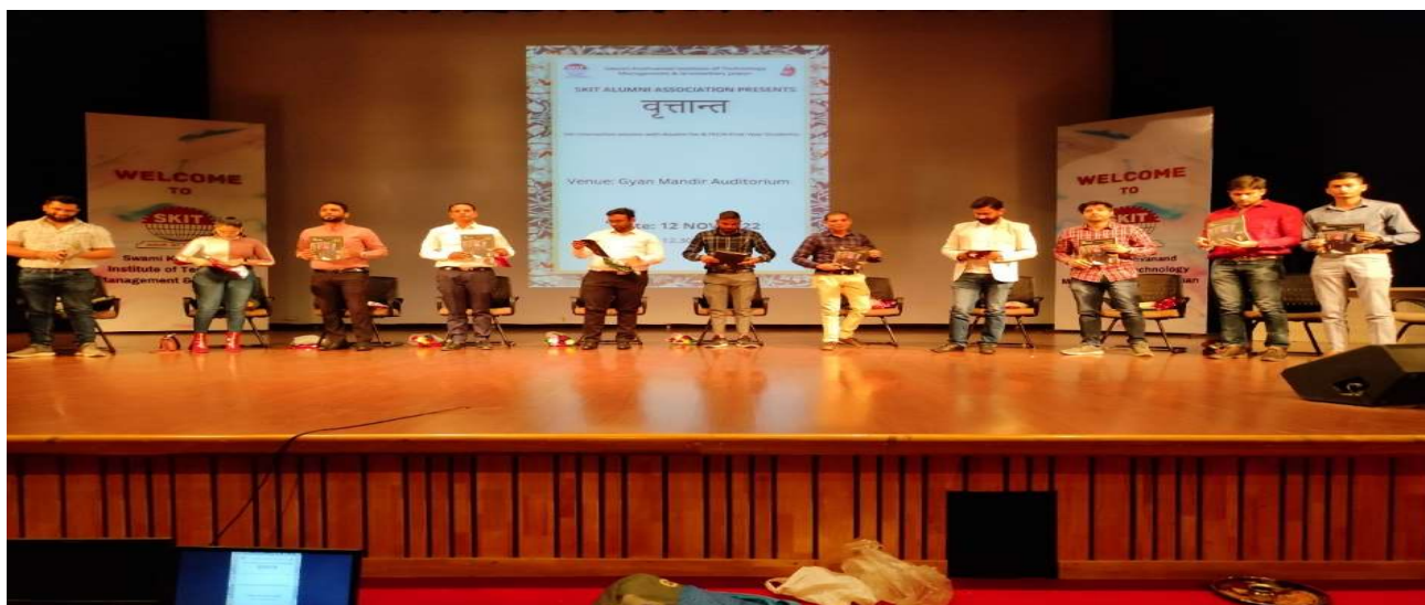
Some Glimpses of the Session