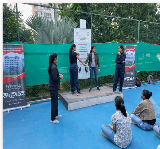
Glimpses of the Workshop