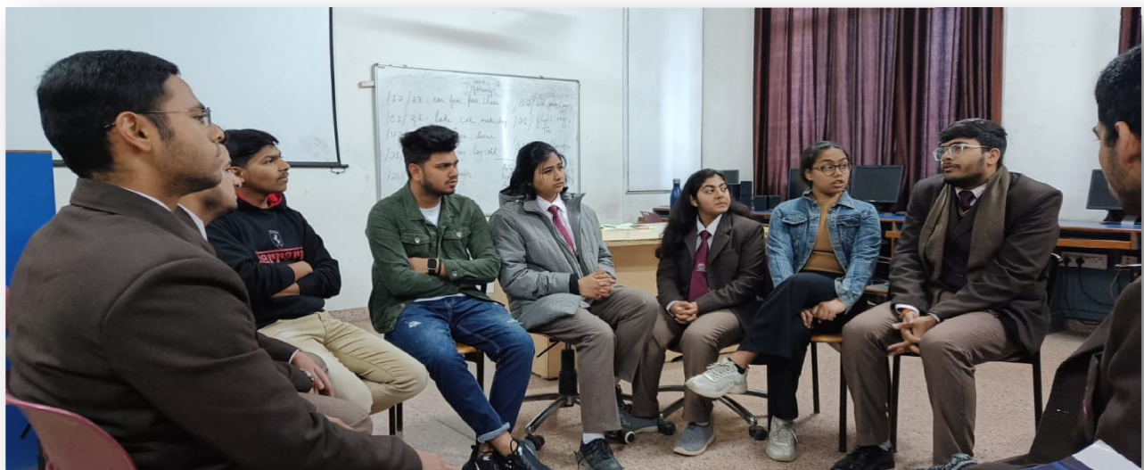
Group Discussion in Language Lab during Proficiency Enhancement Classes

Proficiency classes for English, Mathematics, and Computer were held during the induction program as per the schedule. These special classes catered to the academic domain of proficiency among budding engineers. These proficiency classes were aimed at giving a push to the basic requirements and challenges to students in the specified subjects. These classes were designed in the shape of introductory lectures pertaining to the subjects prescribed in the RTU syllabus of B. Tech.