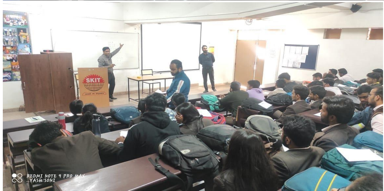
Glimpse/s of the Session