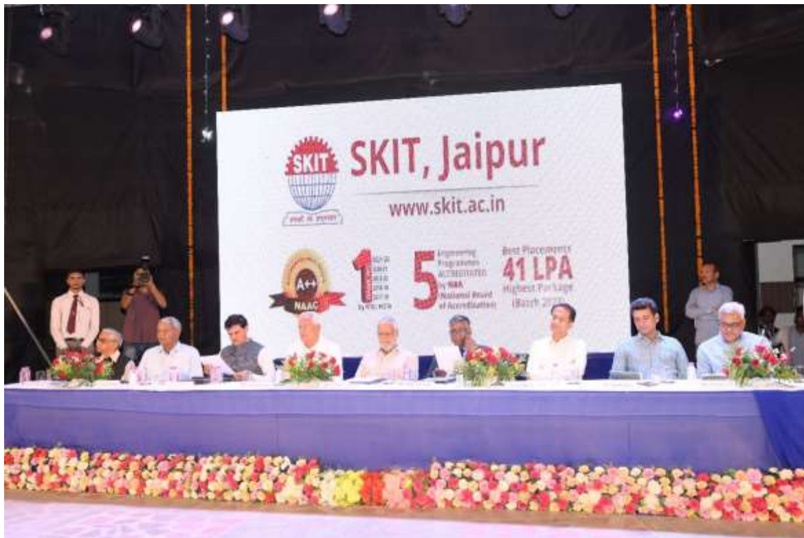
Fig 1: Management watching program