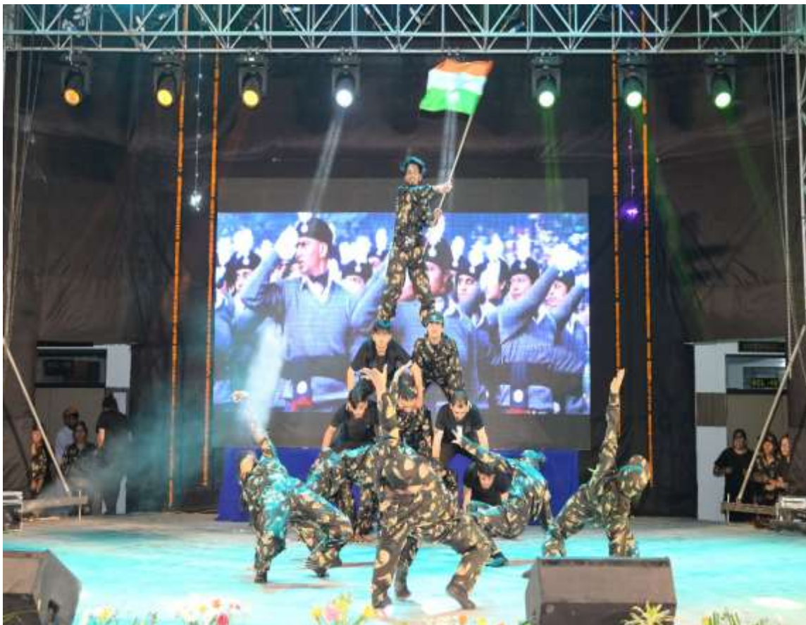
Fig 4: Dance performance