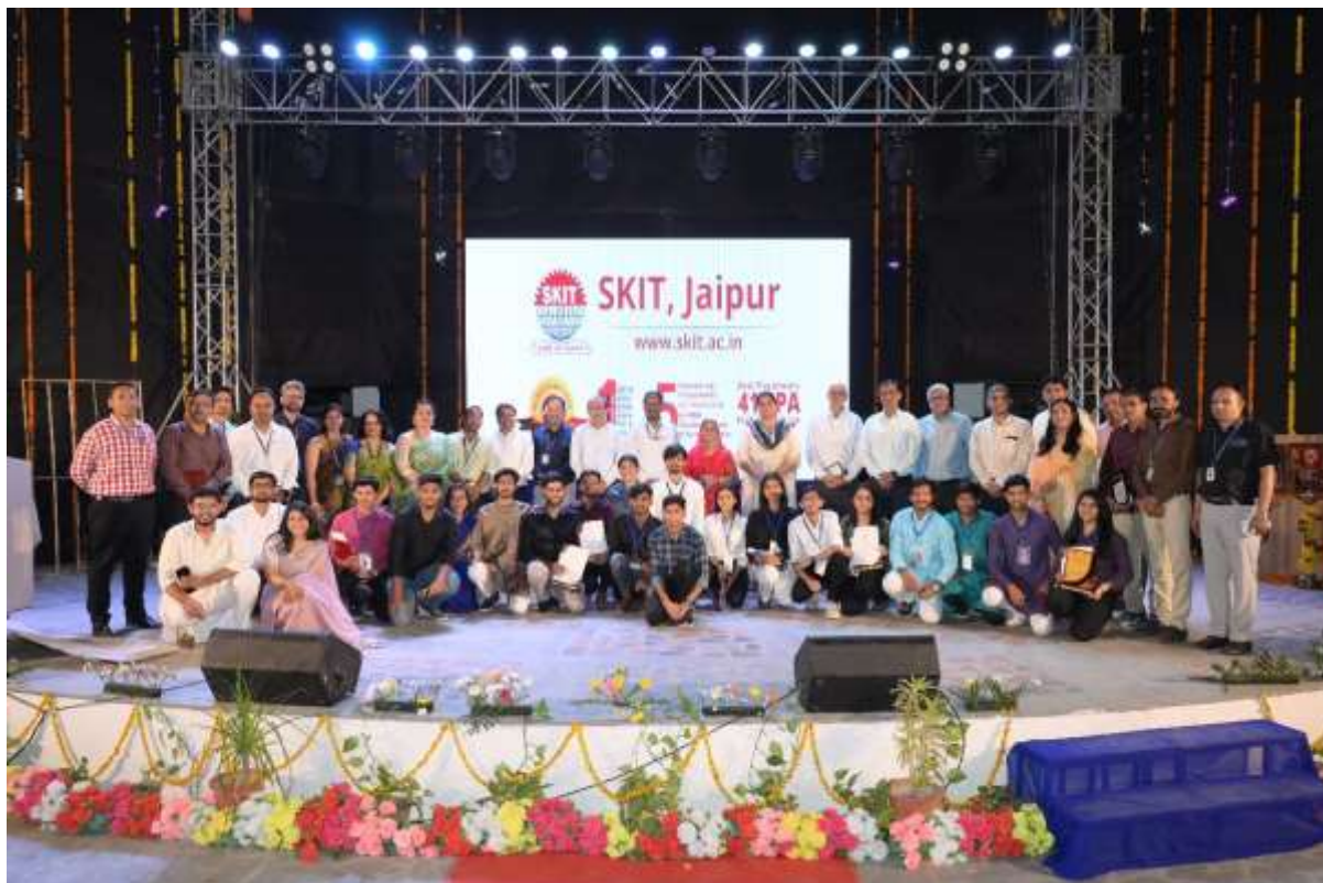
Fig 2: Certificate to core team