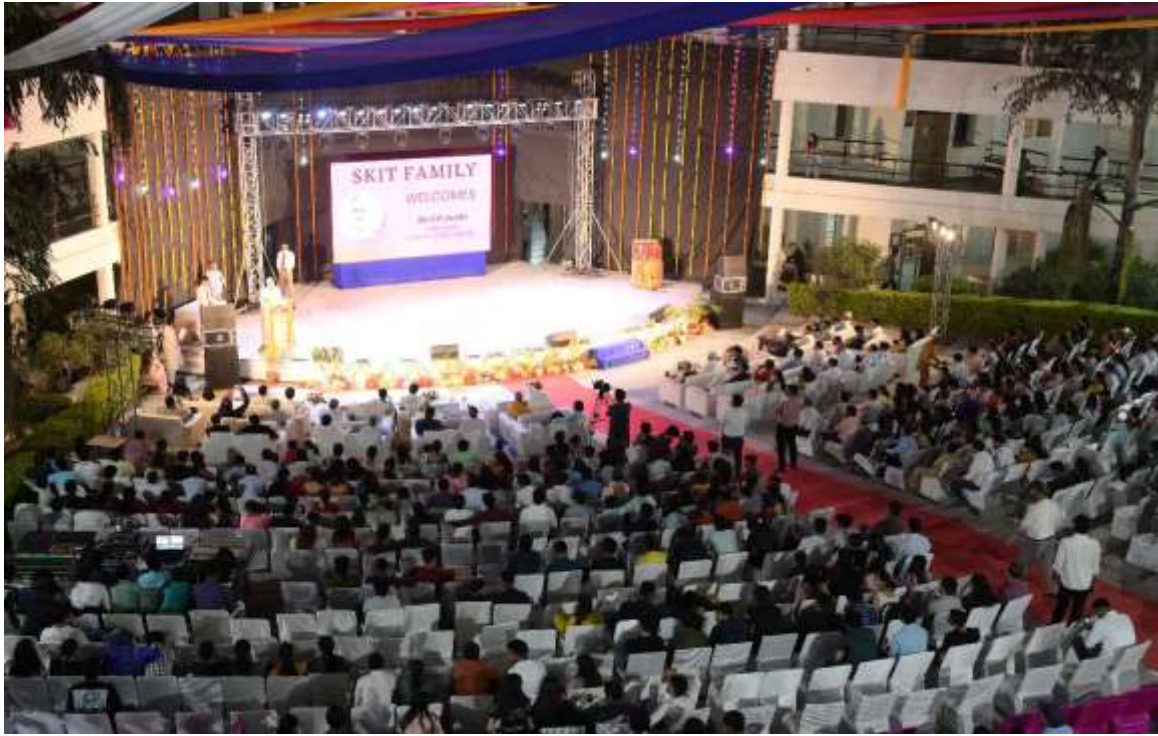
Fig 3: Top view of program