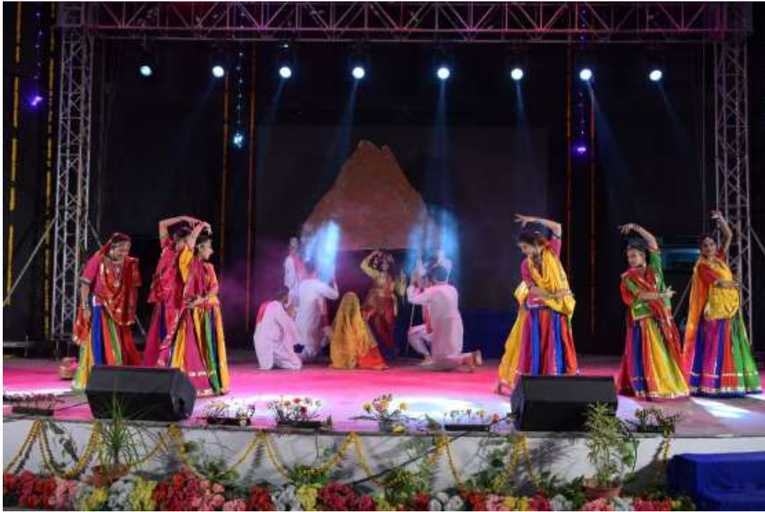
Fig 5: Dance performance