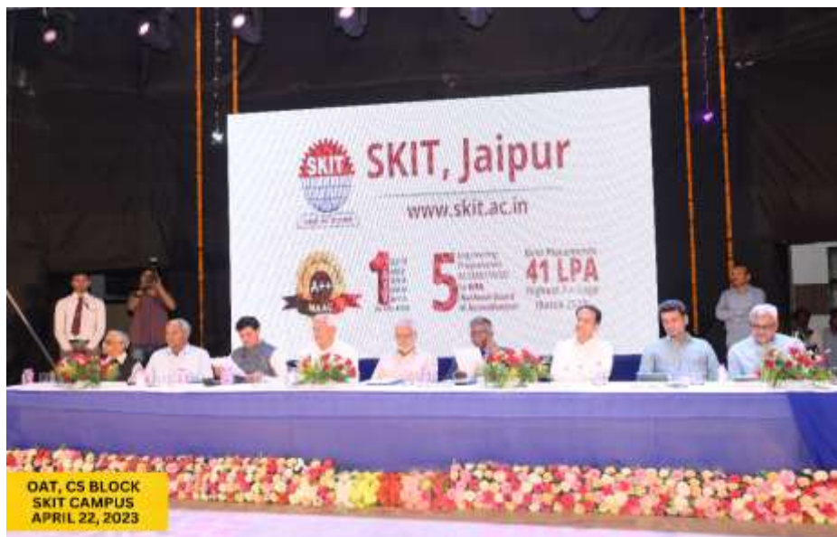
Fig 1: Management watching program