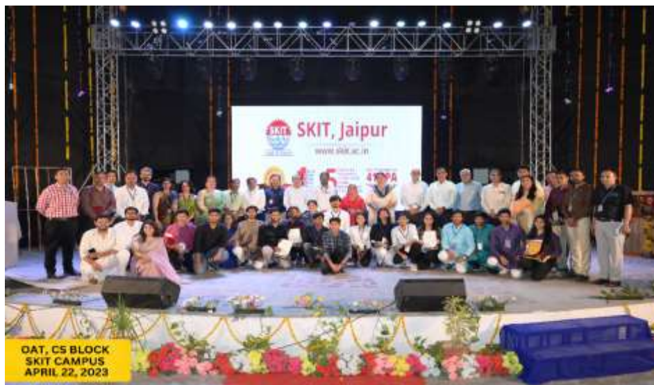
Fig 2: Certificate to core team