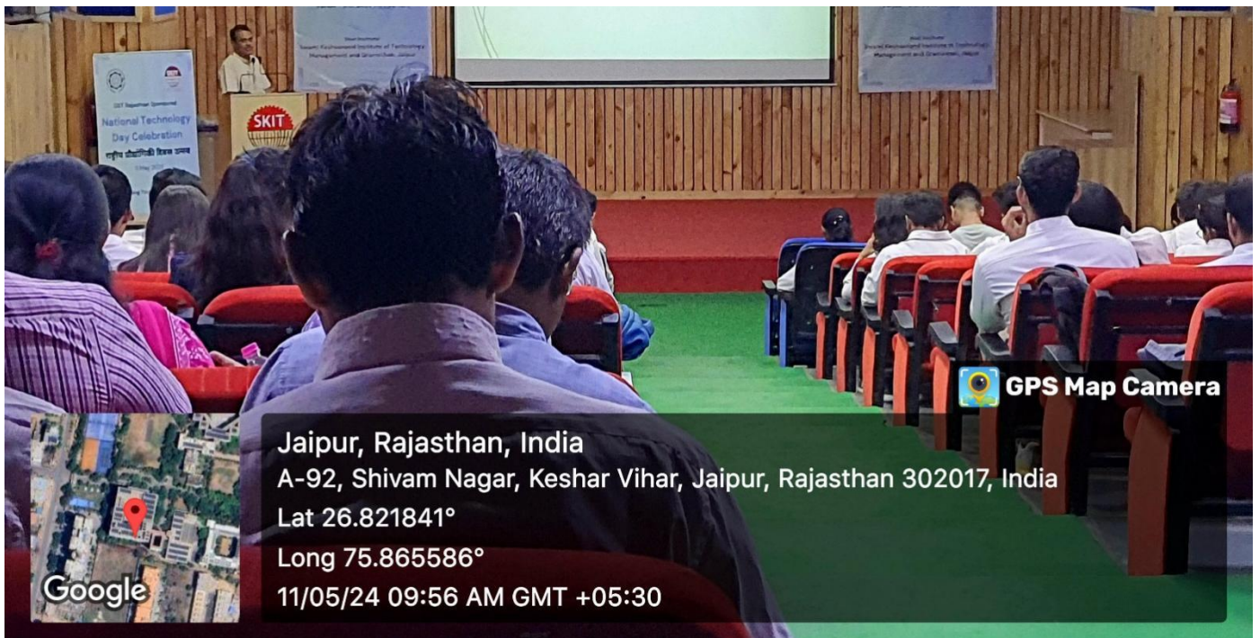
Figure 6: Mr. Brijesh Prajapati's Expert Lecture