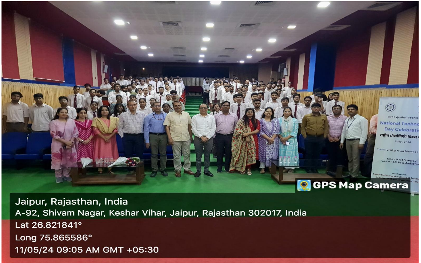
Figure 5: Group Photograph