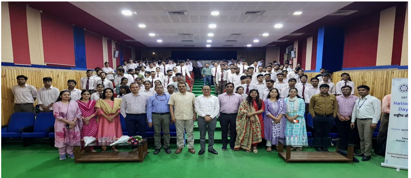
Figure 7: Group Photograph