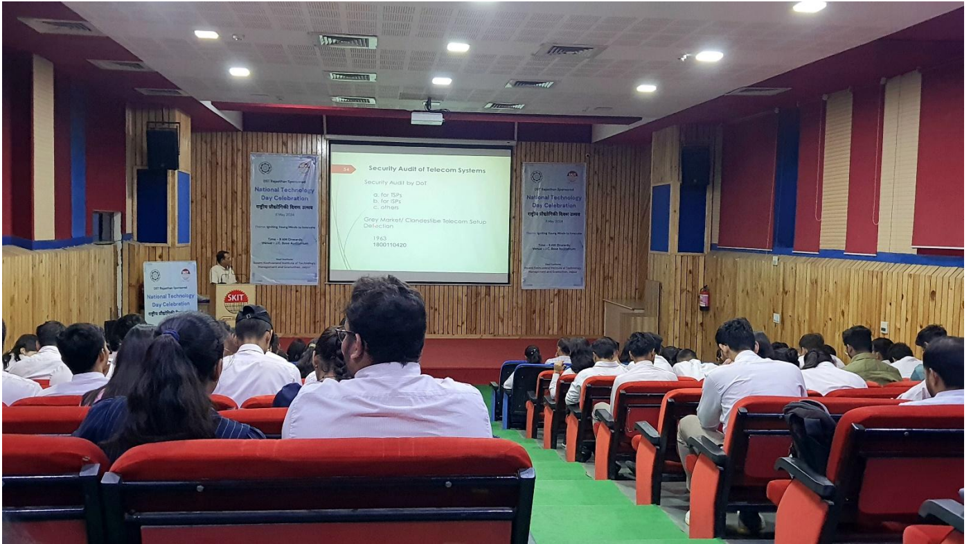
Figure 11: Mr Brijesh Prajapati sharing knowledge