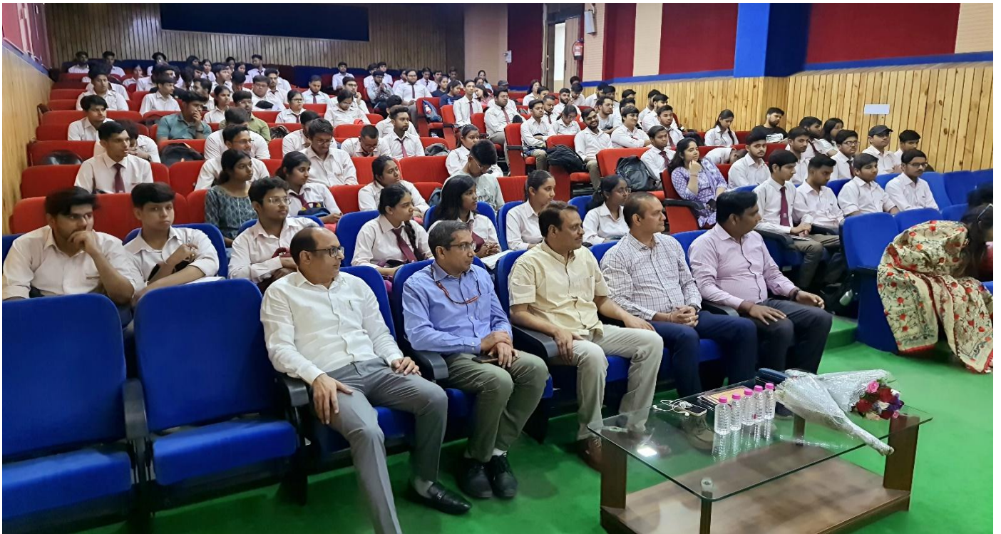
Figure 10: Attendees at the venue