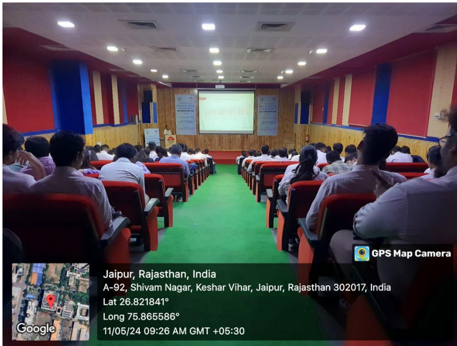
Figure 1: Participants at the venue