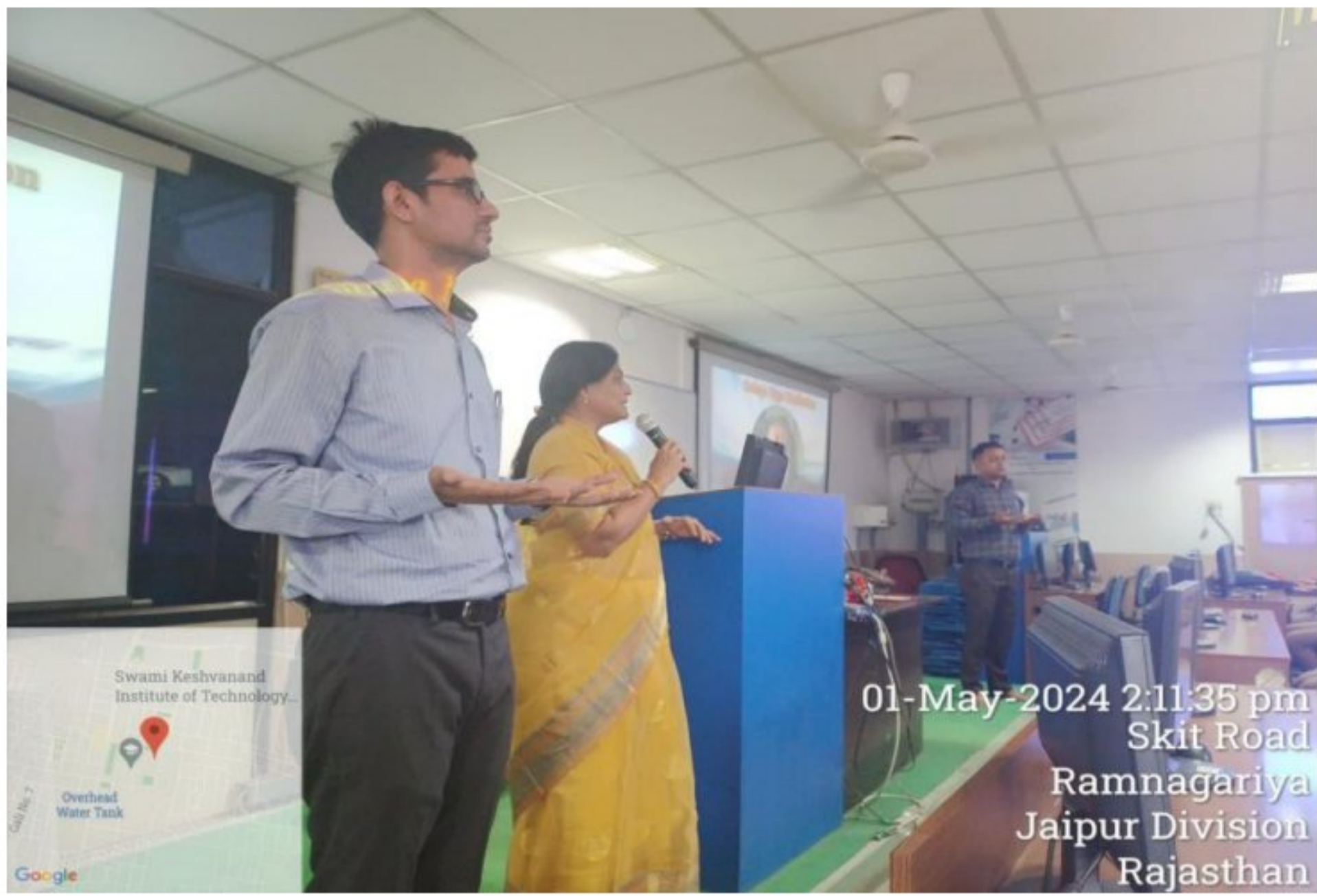
01-May-2024 2:11:35 pm Skit Road Ramnagariya Jaipur Division Rajasthan