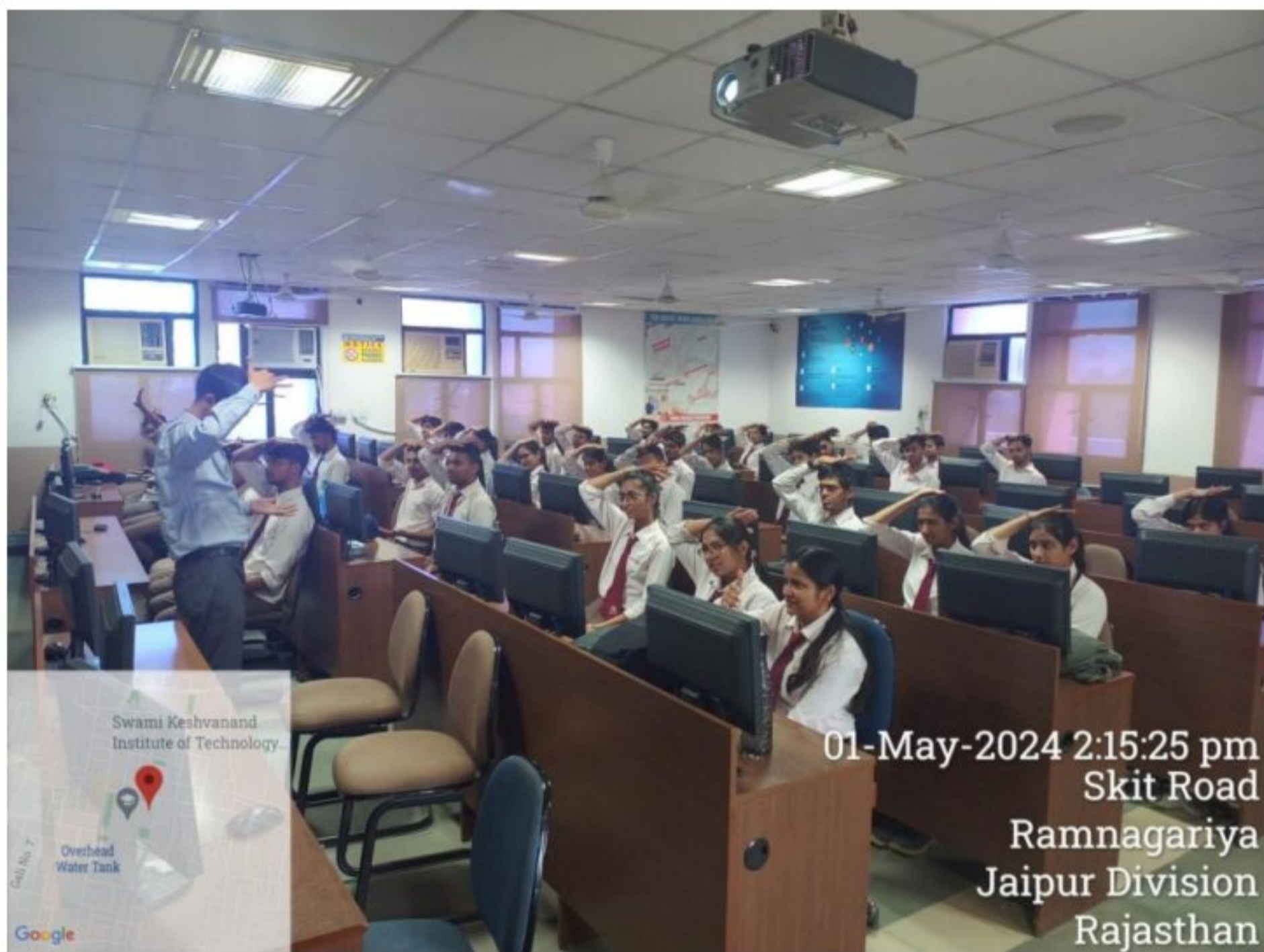
01-May-2024 2:15:25 pm Skit Road Ramnagariya Jaipur Division Rajasthan