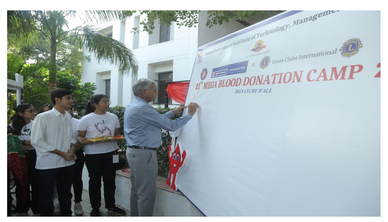
Inaugural (Ribbon cutting ceremony) of BDC-2023 by Chairman, SKITM&G