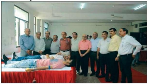
खबरों की दुनिया

जयपुर। स्वामी केशवानंद इंस्टीट्यूट ऑफ़ टेक्नोलॉजी में एचडीएफसी बैंक, लॉयंस क्लब, कॉलेज के रेड क्रॉस क्लब व राष्ट्रीय सेवा योजना (एनएसएस) द्वारा विशाल रक्तदान शिविर आयोजित किया गया। जिसमे कॉलेज के 843 विद्यार्थियों ने रक्तदान किया।