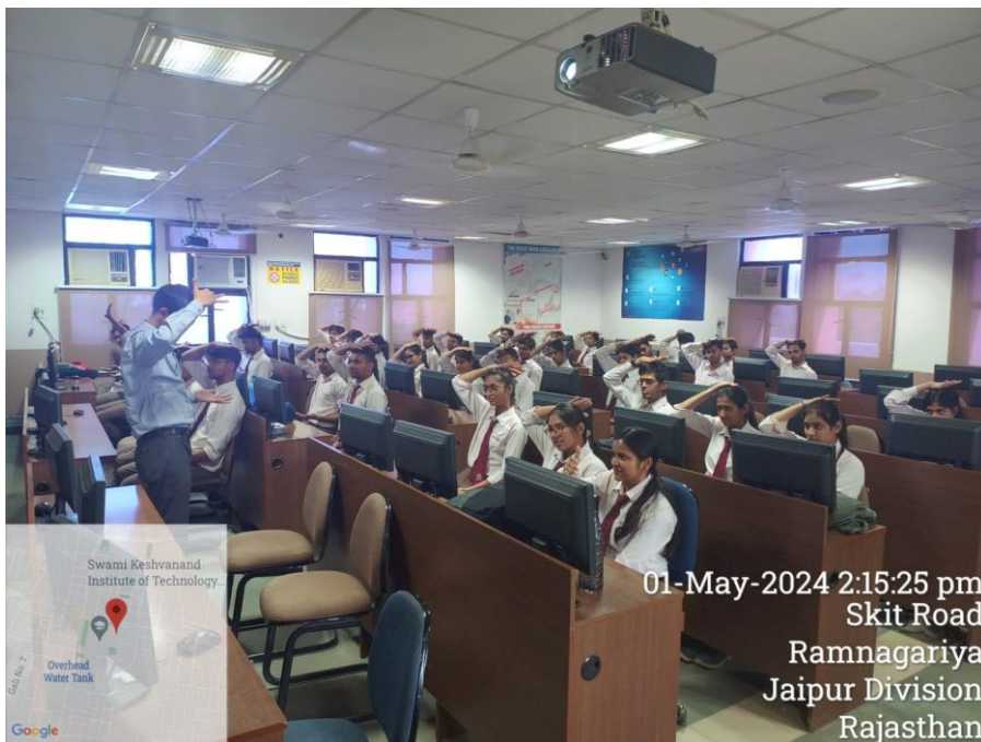
01-May-2024 2:15:25 pm Skit Road Ramnagariya Jaipur Division Rajasthan