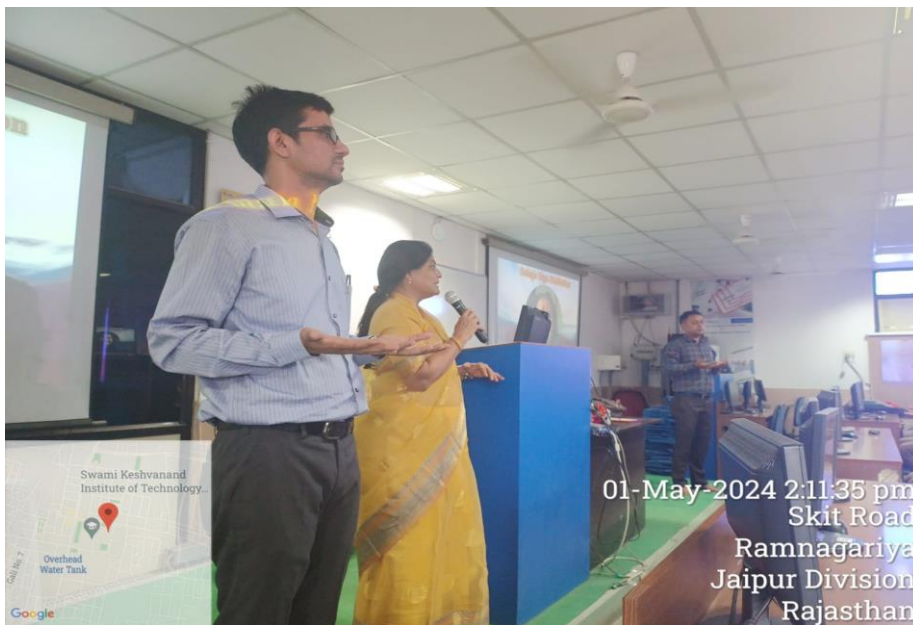
01-May-2024 2:11:35 pm Skit Road Ramnagariya Jaipur Division Rajasthan