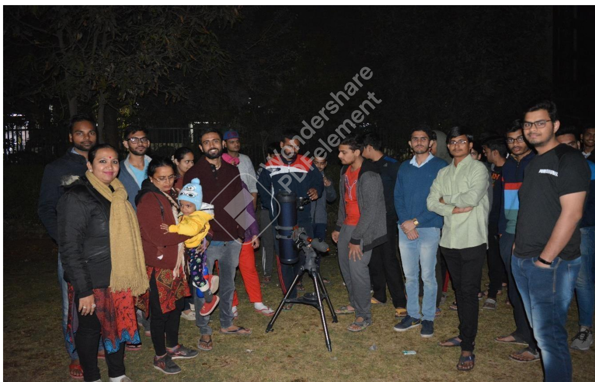
Figure 1 Group Photo of Faculty and Students of NP CAPTURE (Photography Club)