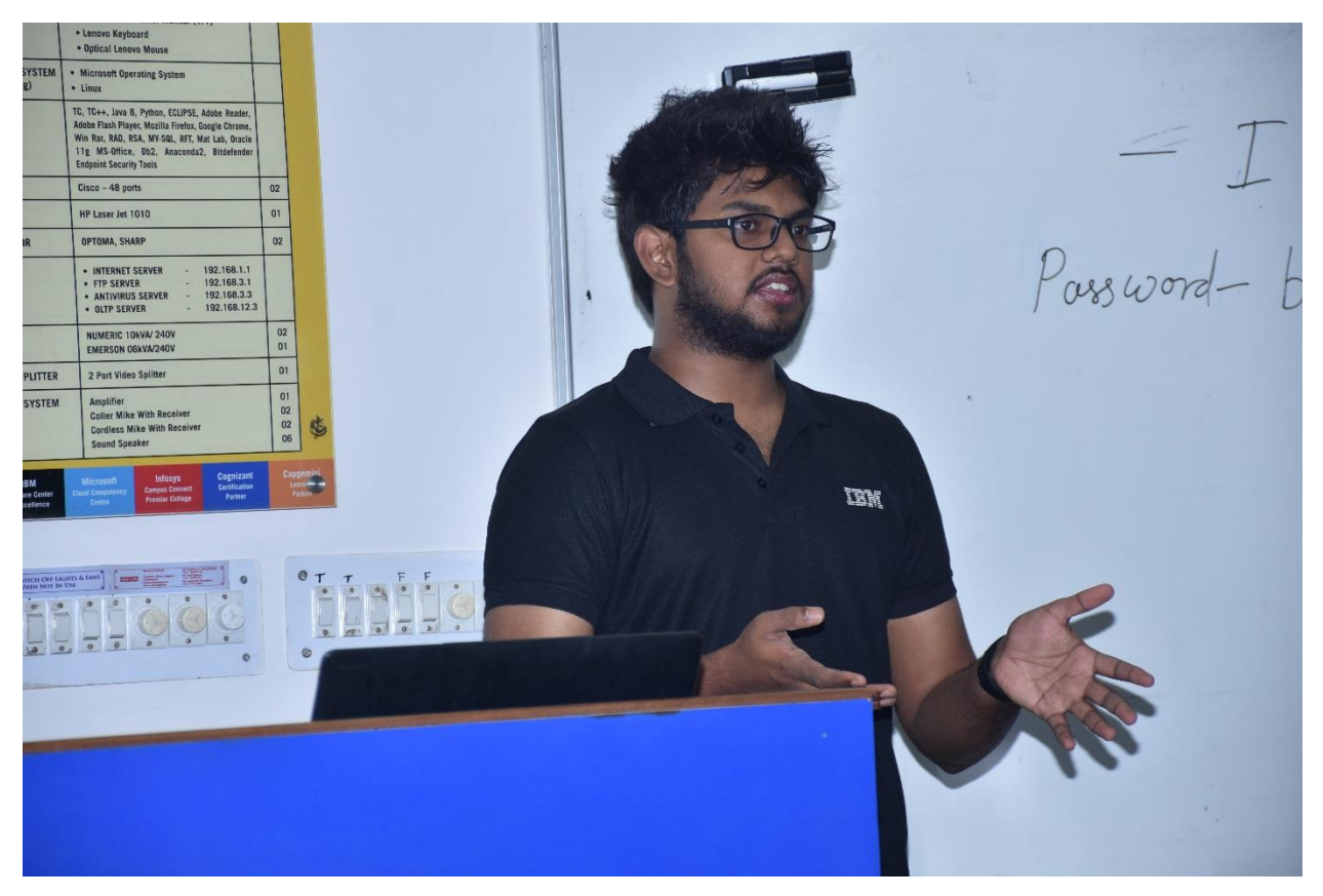
Lab Session on Data Processing Using IoT