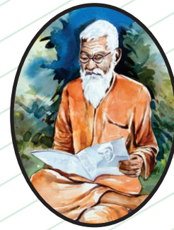
Swami Keshvanand Ji (1883 - 1972)