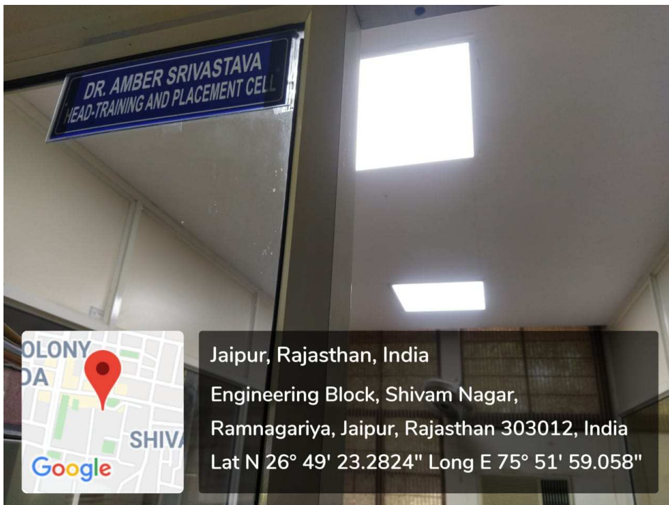
Use of LED Bulbs/Lights in Cabins

📍: RAMNAGARIA (JAGATPURA), JAIPUR-302017 (RAJASTHAN), INDIA