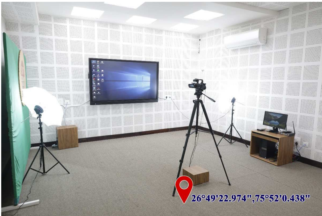
Use of LED Bulbs/ Lights in ICT-eSLATE

📍: RAMNAGARIA (JAGATPURA), JAIPUR-302017 (RAJASTHAN), INDIA