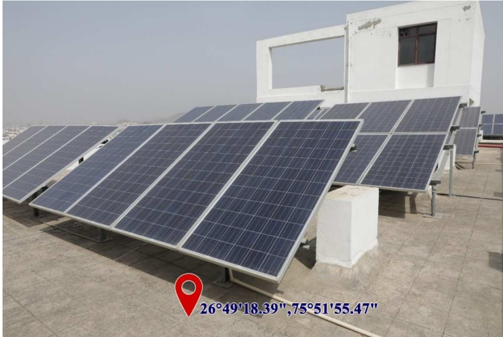
Geotagged Photograph of Solar Power Plant