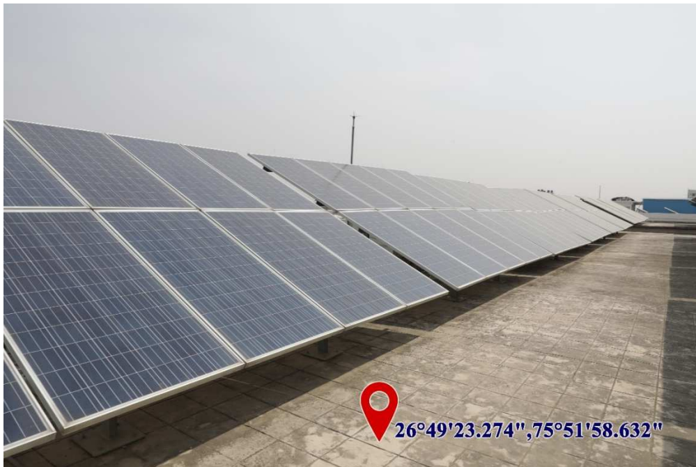
Geotagged Photograph of Solar Power Plant

📍: RAMNAGARIA (JAGATPURA), JAIPUR-302017 (RAJASTHAN), INDIA