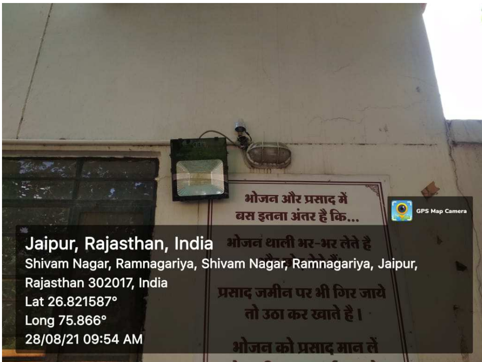
Sensor Based Street/Common light

📍: RAMNAGARIA (JAGATPURA), JAIPUR-302017 (RAJASTHAN), INDIA