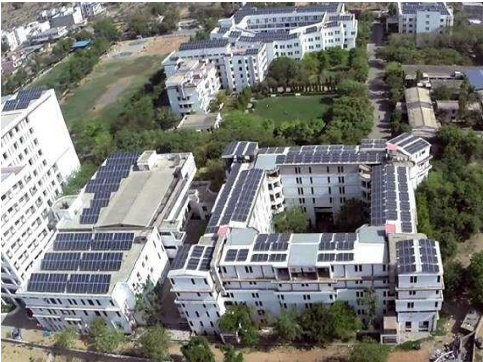
Aerial view of solar power plant

📍: RAMNAGARIA (JAGATPURA), JAIPUR-302017 (RAJASTHAN), INDIA