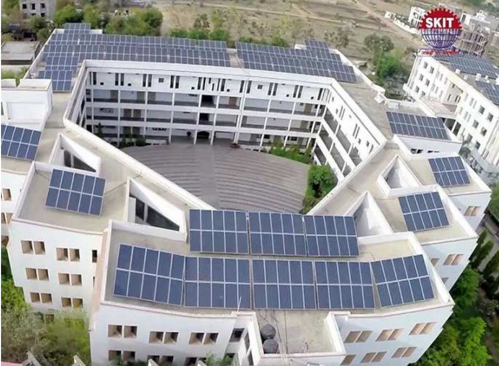
Aerial view of solar power plant

Affiliated to Rajasthan Technical University, Kota