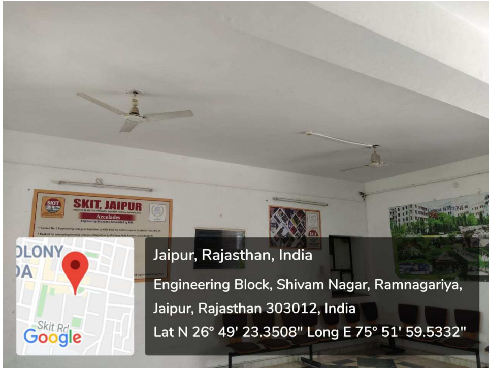
Motion Sensor Based Ceiling fans