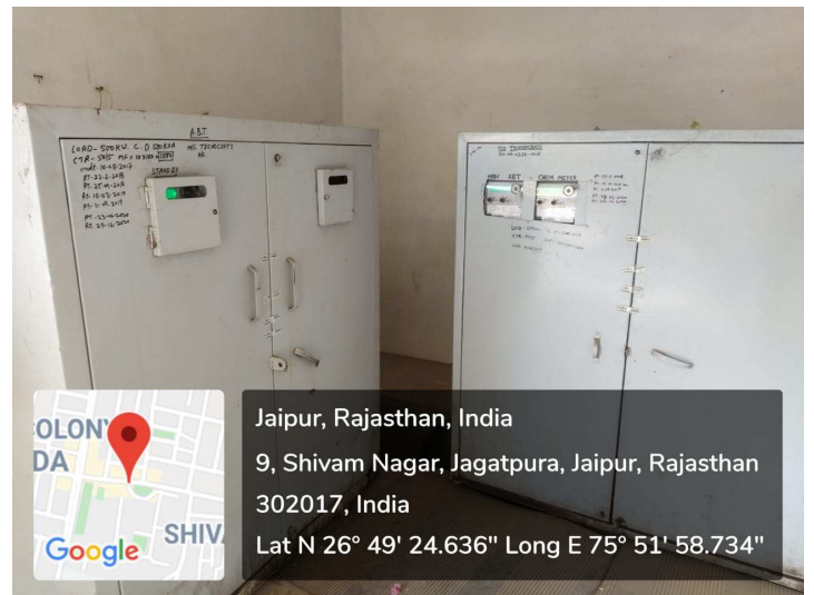
Two-way Electricity Meter