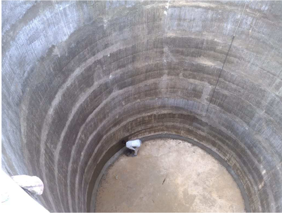
Water Harvesting System: Construction of Underground Tank

Rain water harvesting system/ Construction of tanks:-