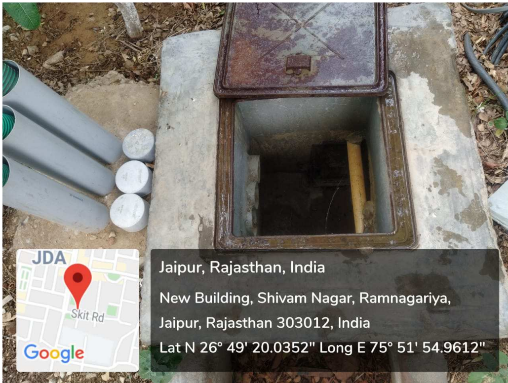
Water Harvesting System in the campus

📍: RAMNAGARIA (JAGATPURA), JAIPUR-302017 (RAJASTHAN), INDIA