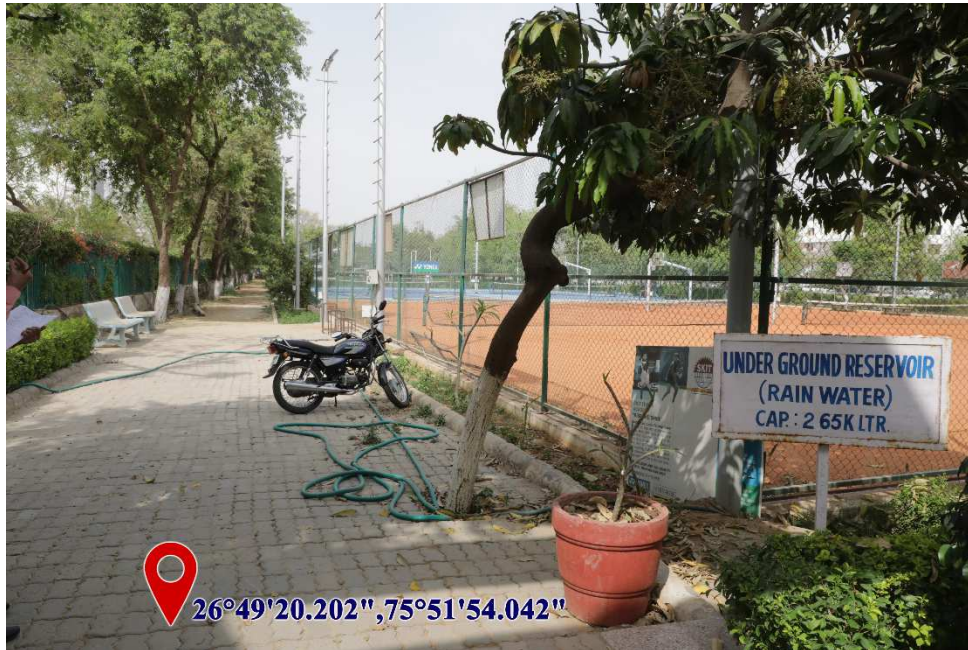
Geotagged photograph of Underground Tank

Affiliated to Rajasthan Technical University, Kota