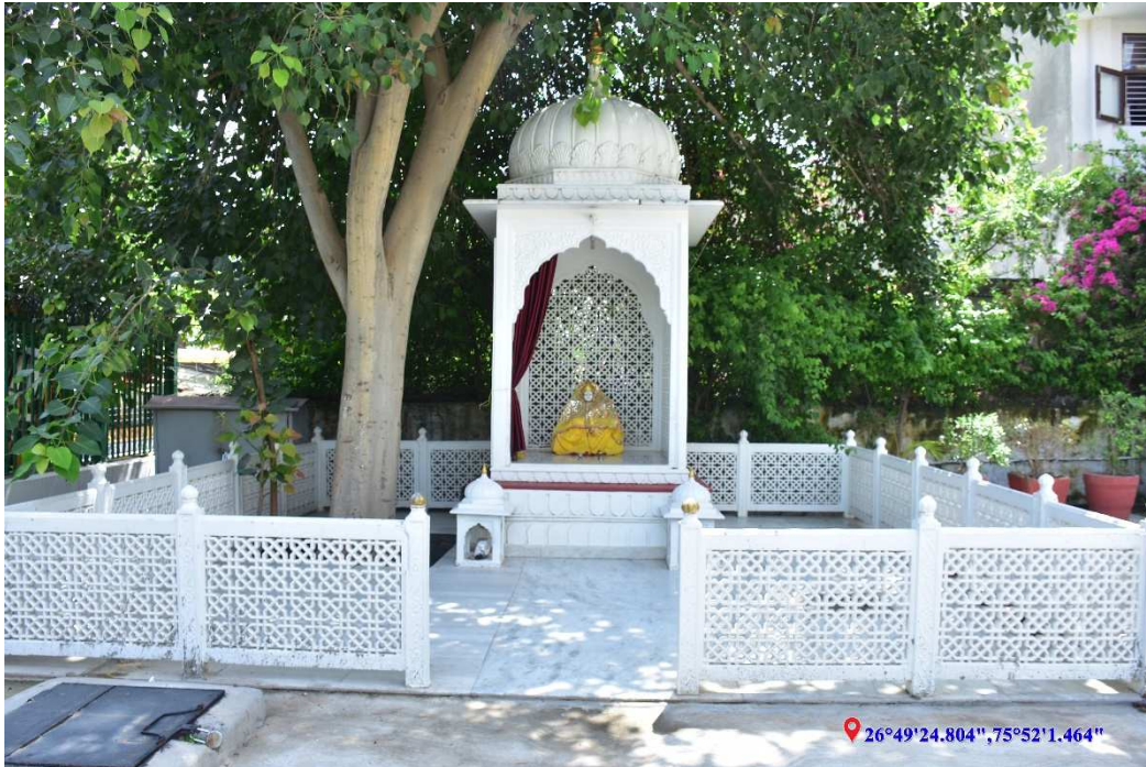
Geotagged photograph of Underground Tank

Affiliated to Rajasthan Technical University, Kota