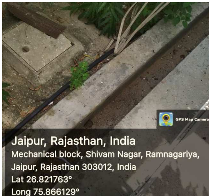
Bore well in the campus

Jaipur, Rajasthan, India Mechanical block, Shivam Nagar, Ramnagariya, Jaipur, Rajasthan 303012, India Lat 26.821763° Long 75.866129°