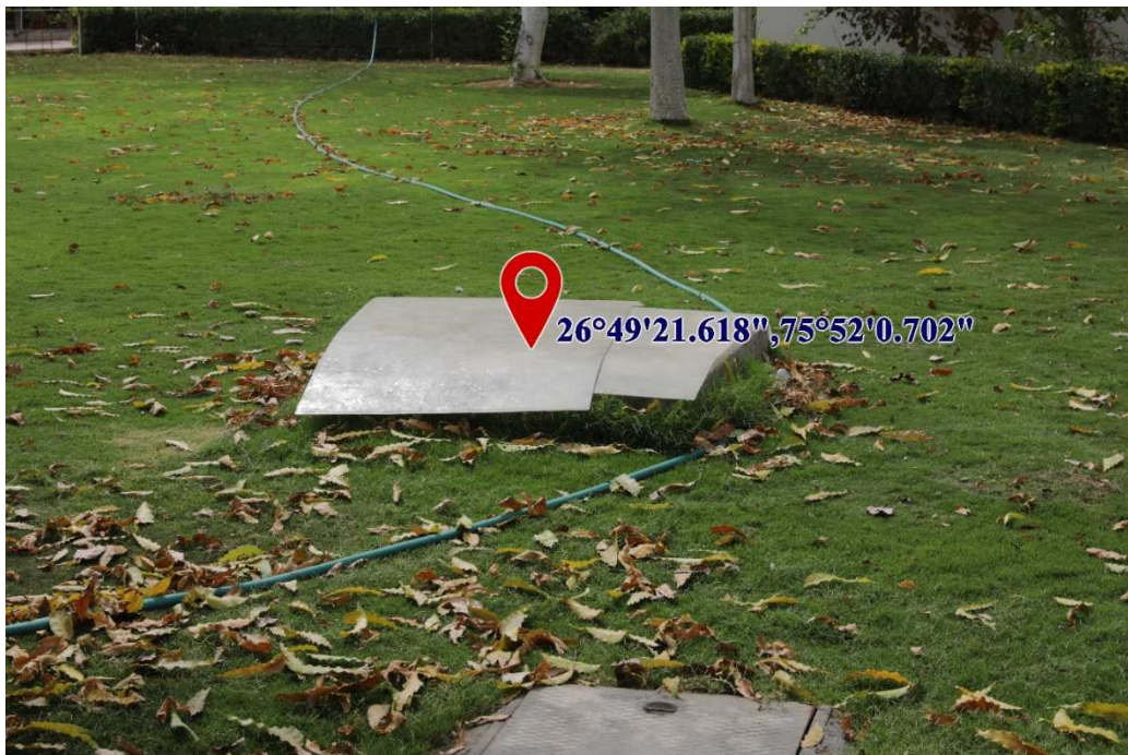
Geotagged photograph of Underground Tank

📍: RAMNAGARIA (JAGATPURA), JAIPUR-302017 (RAJASTHAN), INDIA