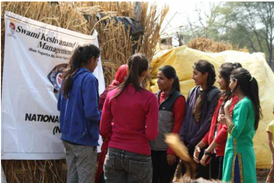
Awareness of Health and Hygiene for Women by SKIT Girls

Girl volunteers of NSS created awareness for Health and Hygiene of women and educated them about the proper usage of and disposal of sanitary pads.