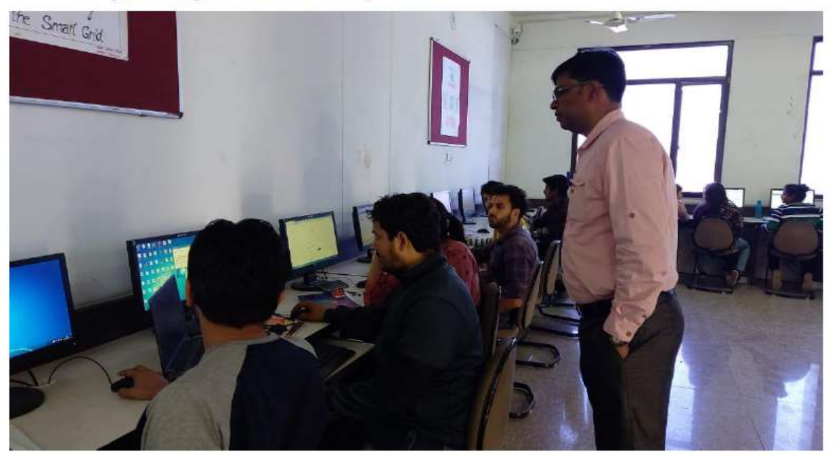
Lab Session on Model Order Reduction