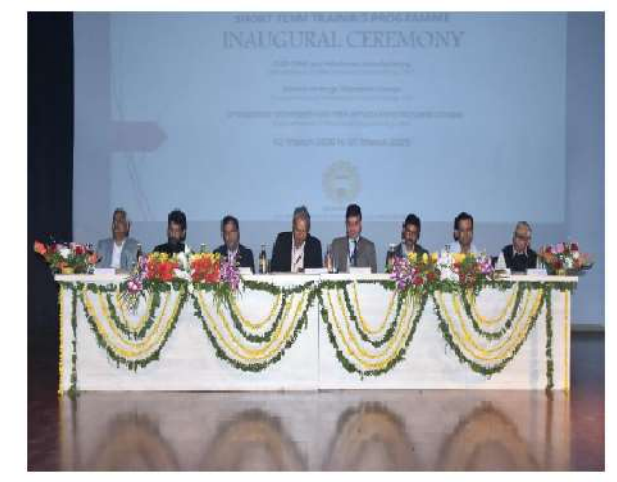
Inaugural Ceremony of OTAPS-2020