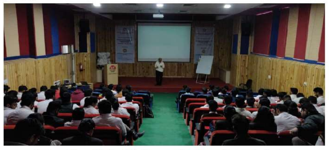
Lecture delivered by Dr. S. L. Surana on Real Power System Applications

Immediately after these two sessions a test based on the knowledge imparted was conducted. During compilation of the results and participants were asked to complete and give the feedback of the program. Analysis of the feedback taken was as under based on the marks given by the participants.