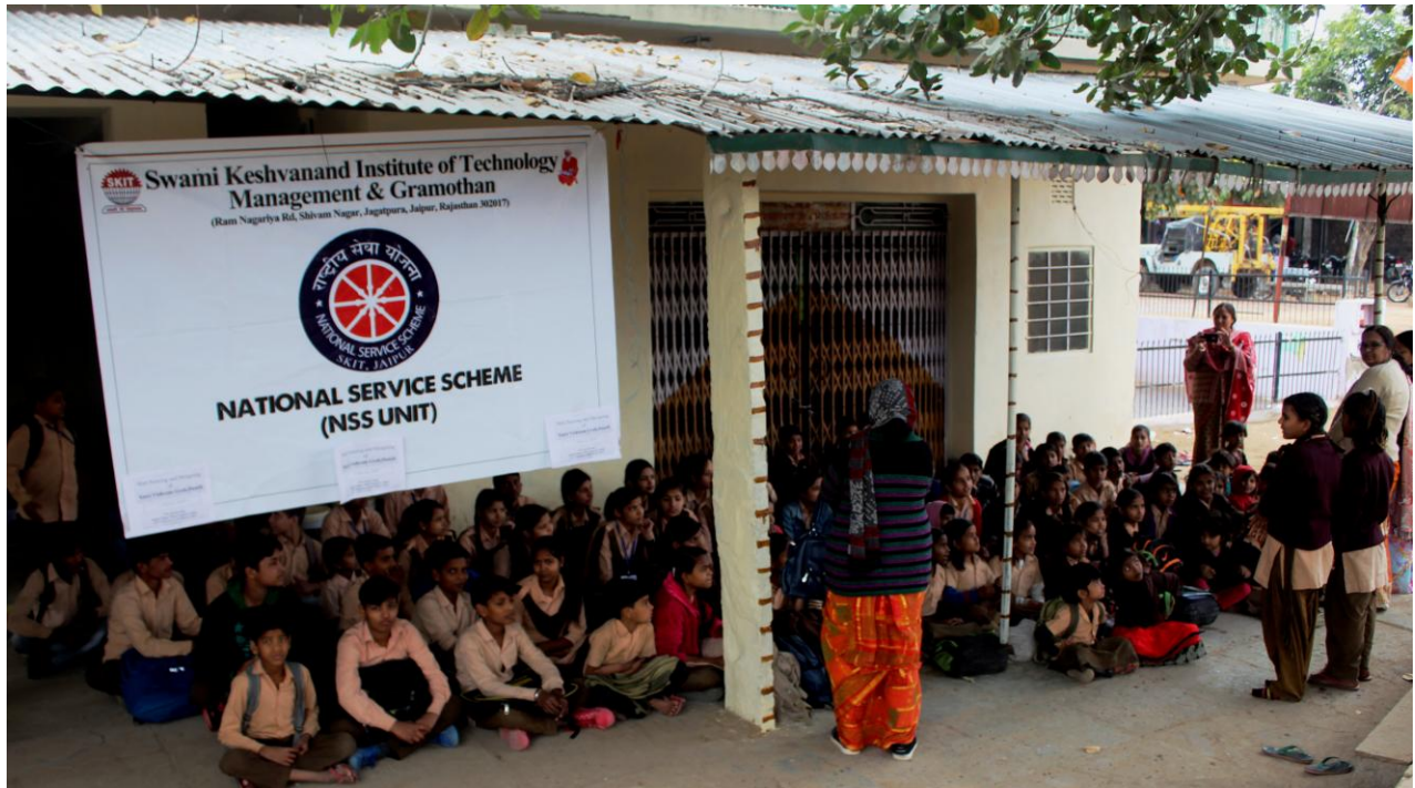
4.4. F Volunteers Interact with Students of Government School on Different Issues.