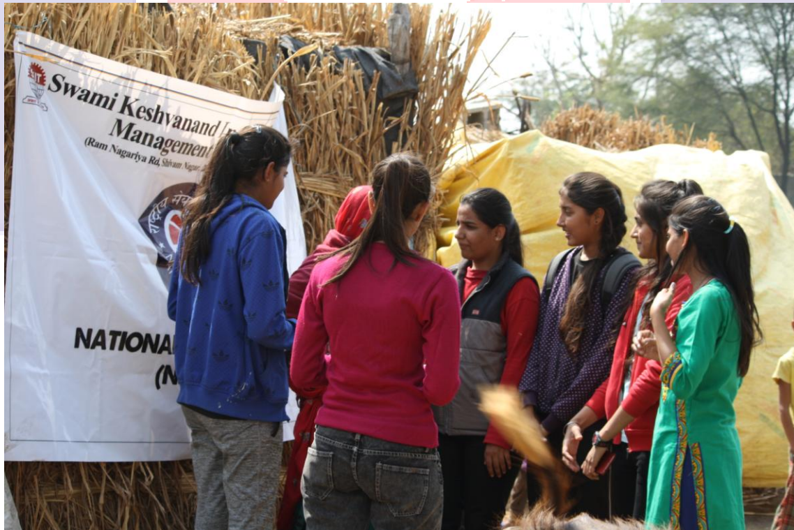
4.6 C Awareness of Health and Hygiene for Women