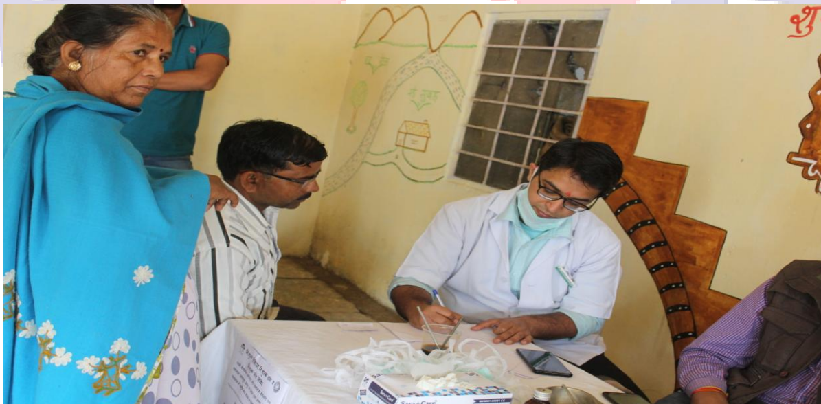
4.7. C Medical Check-up by Doctor in Camp