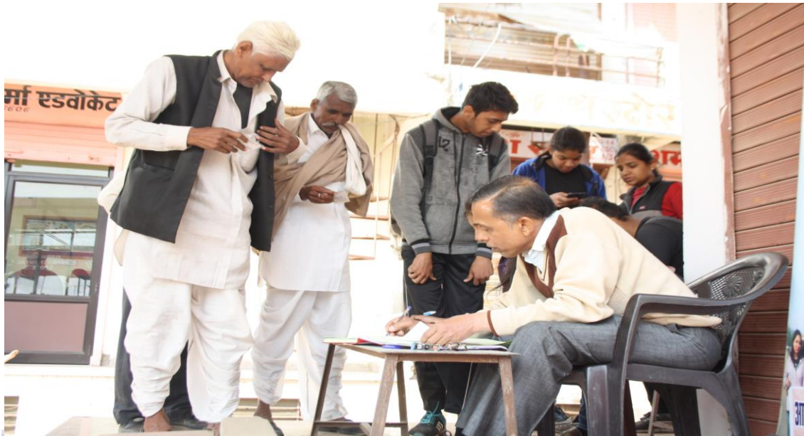
4.5.B Eye Camp by NSS Team SKIT