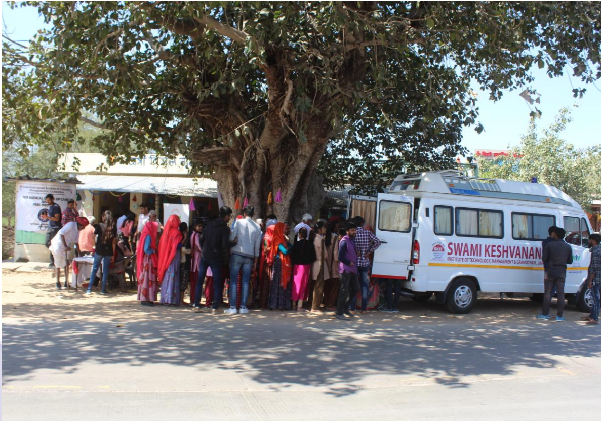
4.7 B Free Distribution of Medicines and Free Check-up by SKIT Medical Van