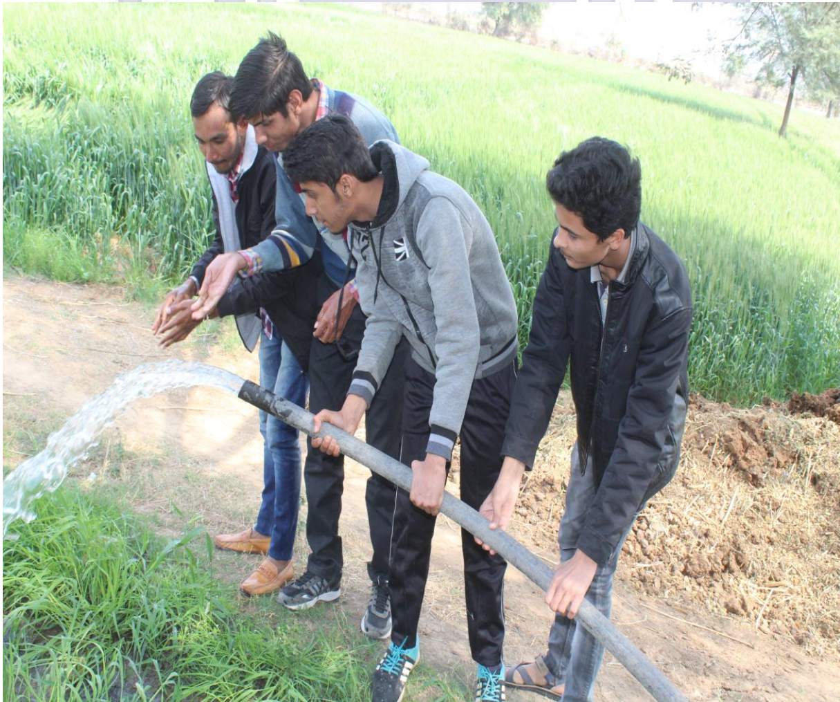
4.6 A Volunteers Work with Irrigation Systems for Improvement