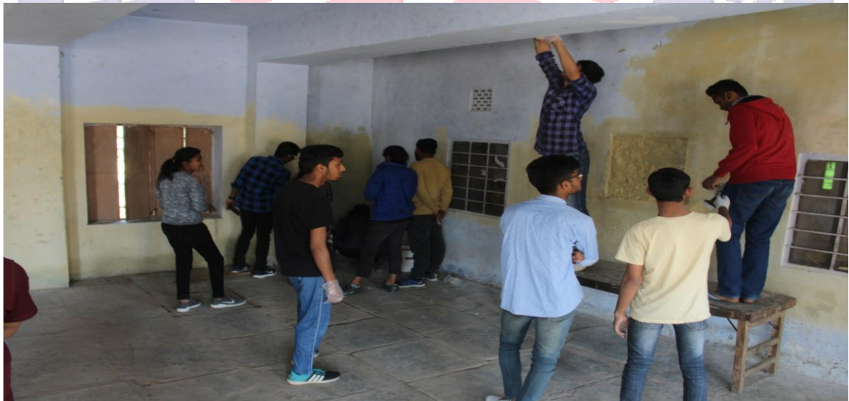
4.3 B Painting of “Yatri Vishram Grah”