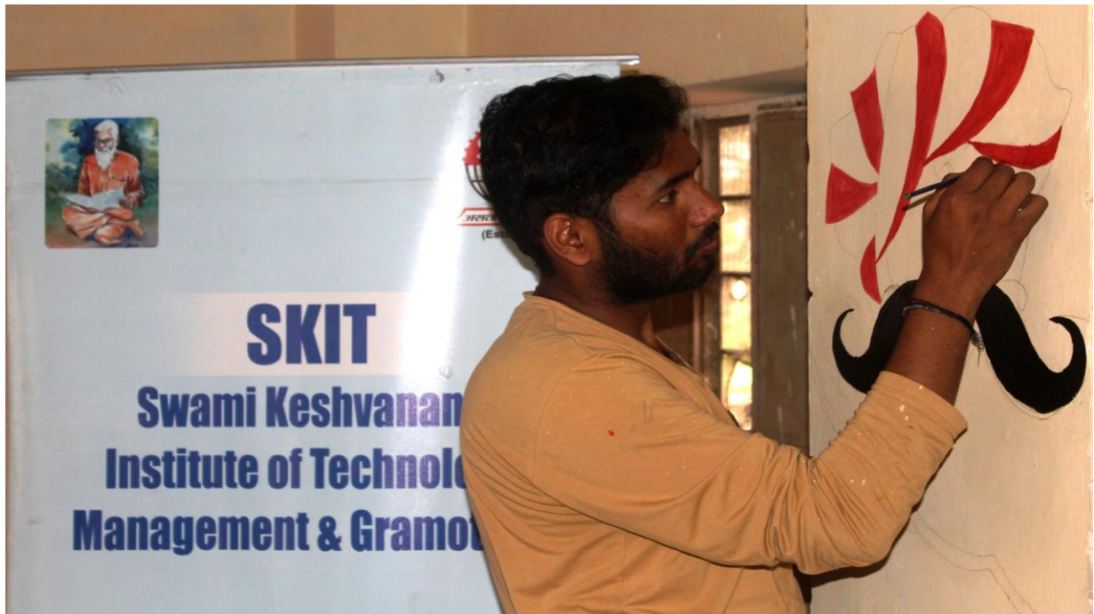
4.4 B Wall Painting and Making Designs