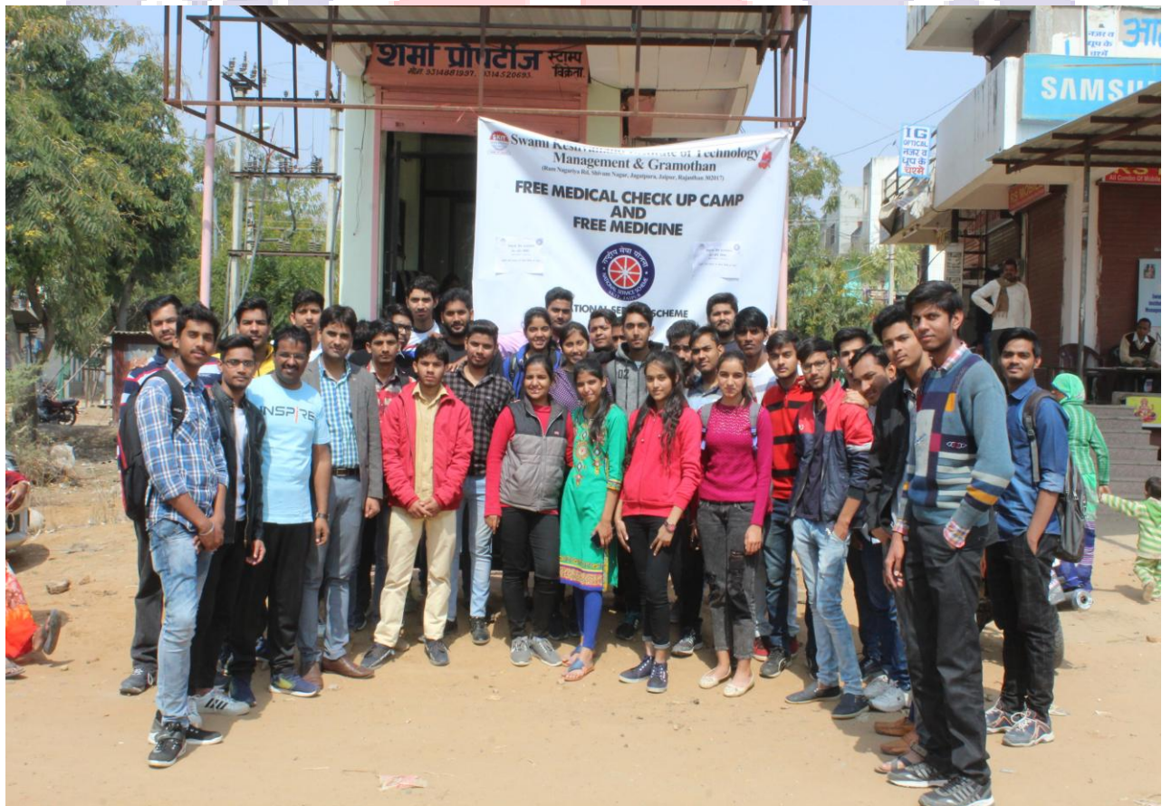
4.5 A Team of Eye Camp