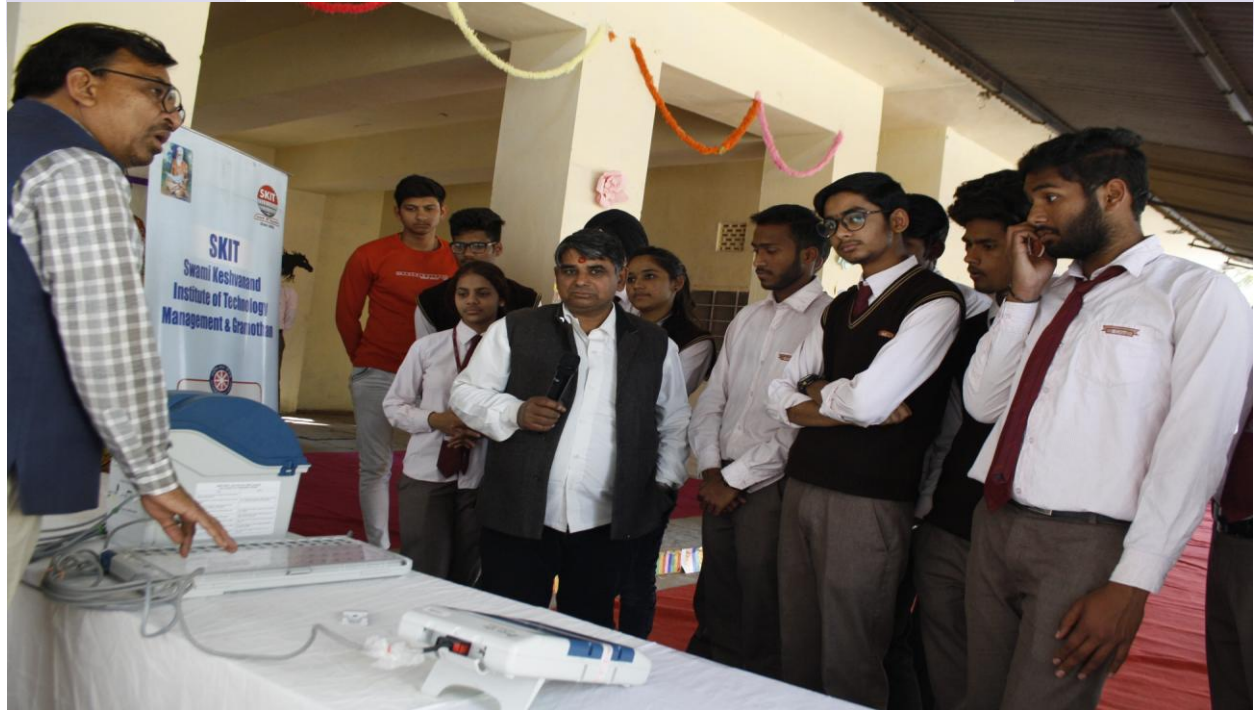
5F. Last activity of Camp EVM Machine Demonstration to Villagers by Student Volunteers