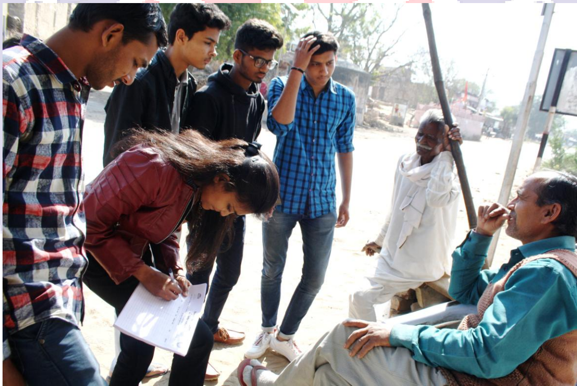
4.2 B Girl Volunteers during Registration for Eye Camp