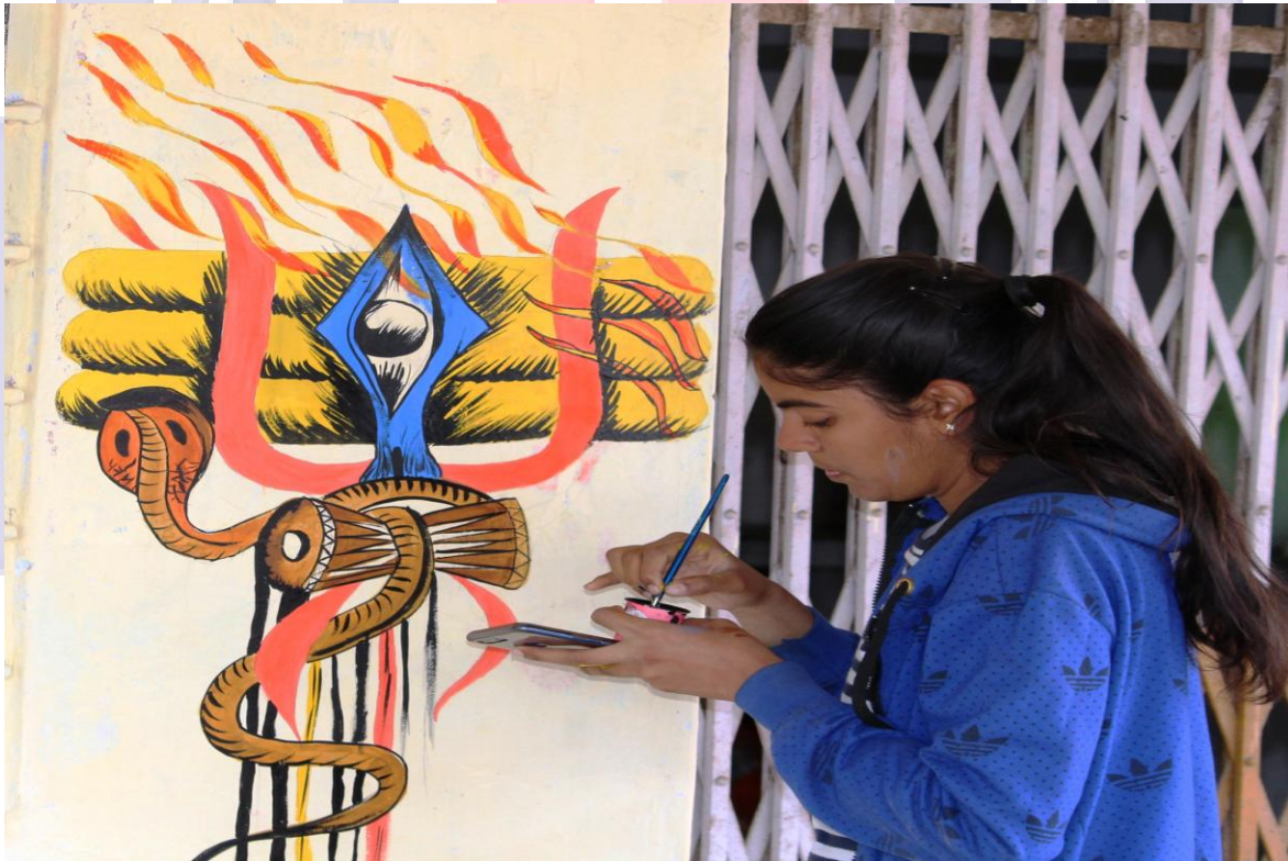
4.4 A Wall Painting and Depicting Designs on the Wall of Temple on the Occasion of Maha Shivratri during Camp