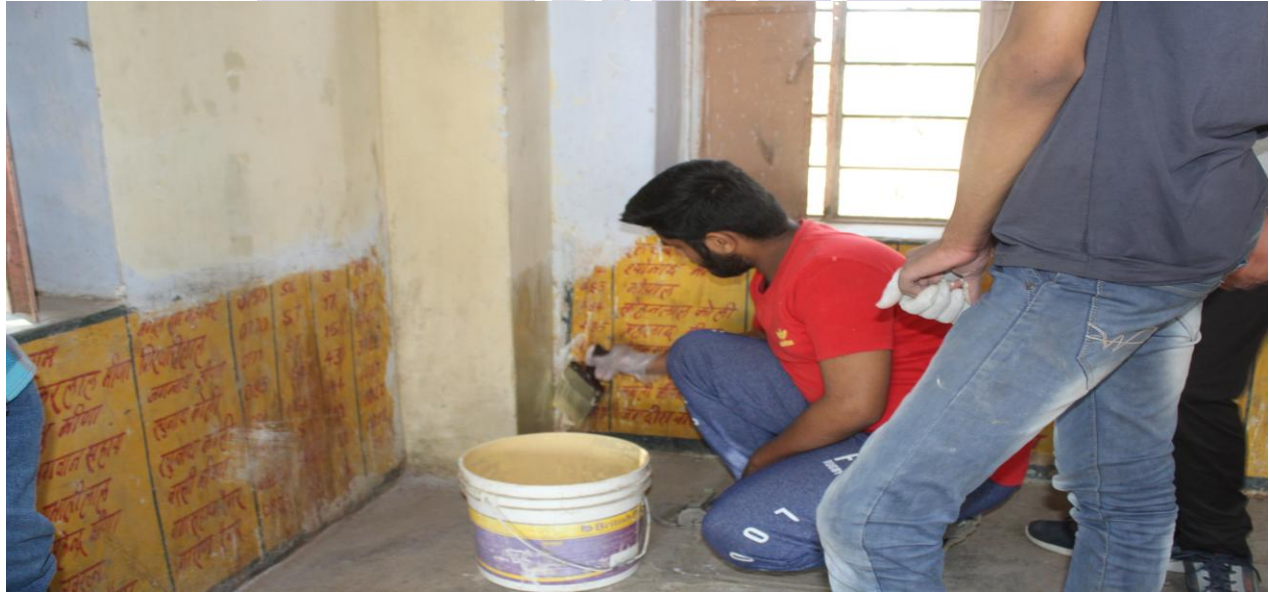
4.3 A Painting of “Yatri Vishram Grah”