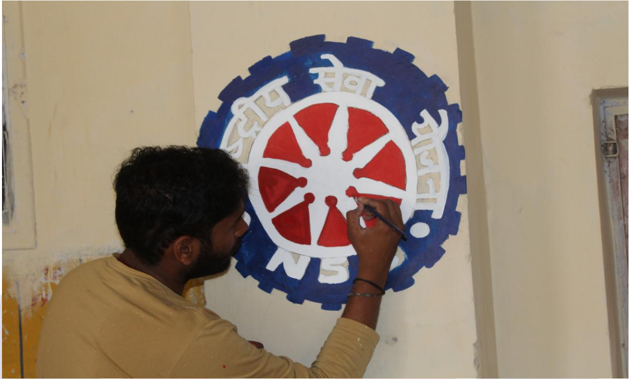
4.4D Making Logo of NSS on the wall of Yatri Vishram Grah