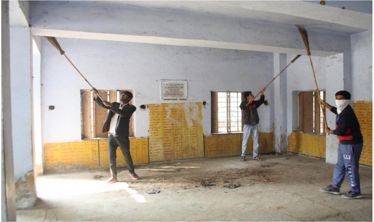
4.1.C Cleaning Drive by Volunteers in Dantli Village