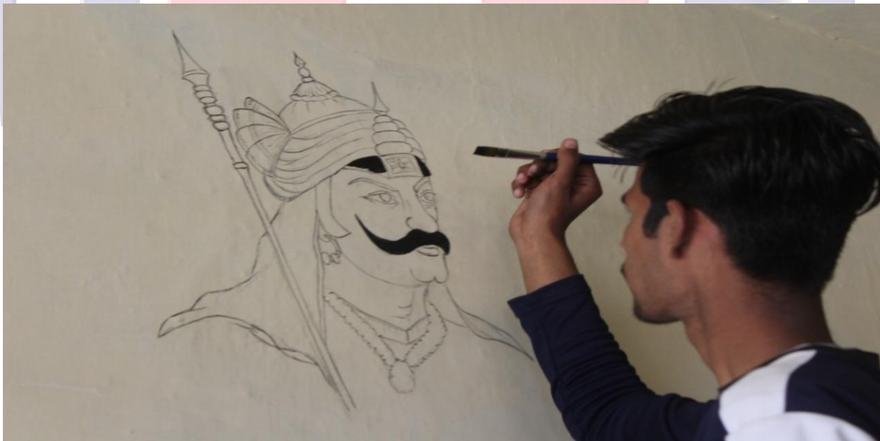
4.3D Sketching the photo of Great Mewad King Maharana Pratap