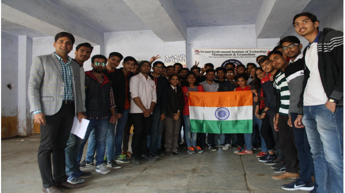
4.1.A During Shradhanjali to Pulwama Attack Soldiers