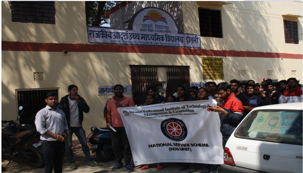
4.1.D Rally for Awareness Regarding "Swachh Bharat Swasth Bharat"