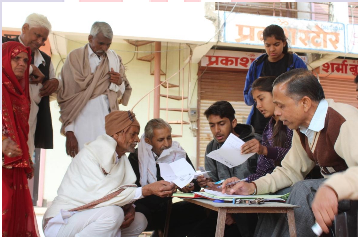
4.5.C Eye Camp Registration process by Volunteers