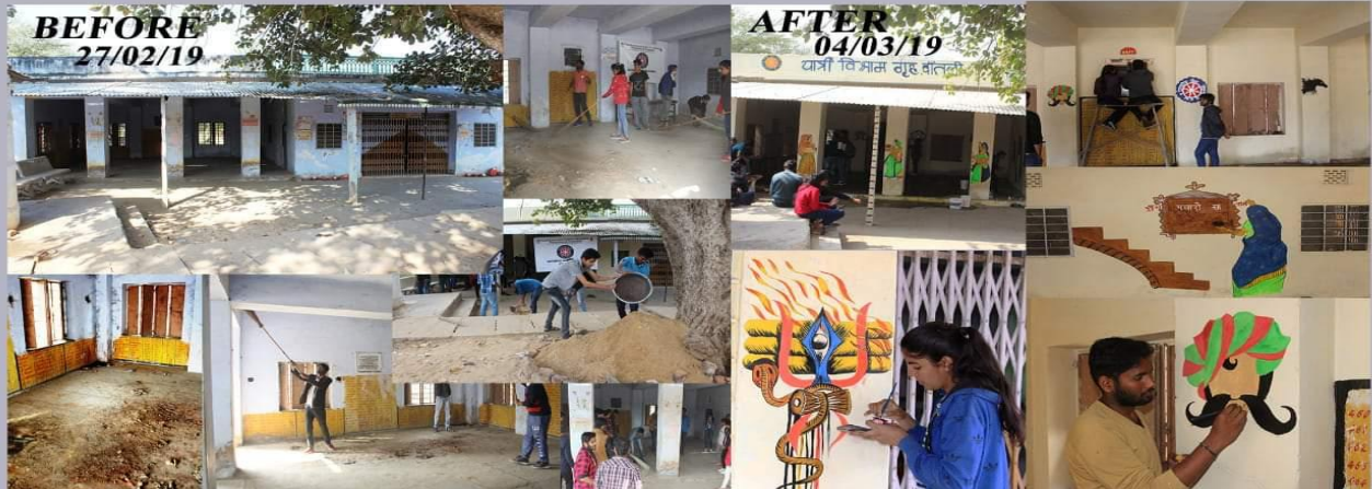
4.4E "Kayakalp" of Yatri Vishram Grah