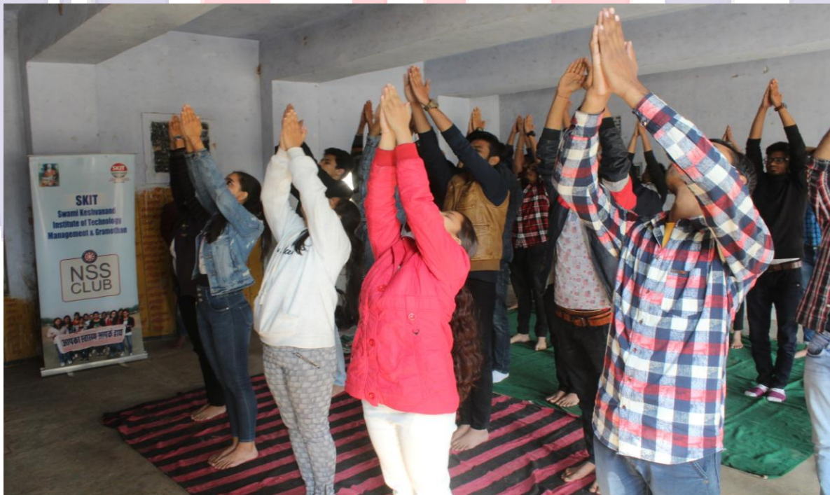
4.2 A Morning Assembly with NSS Song and Yoga Exercises