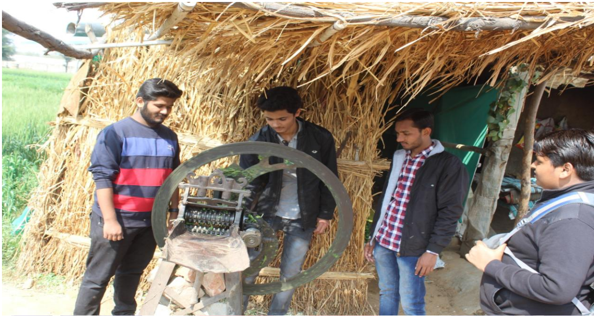
4.6 B Appling New Technology for Farmers