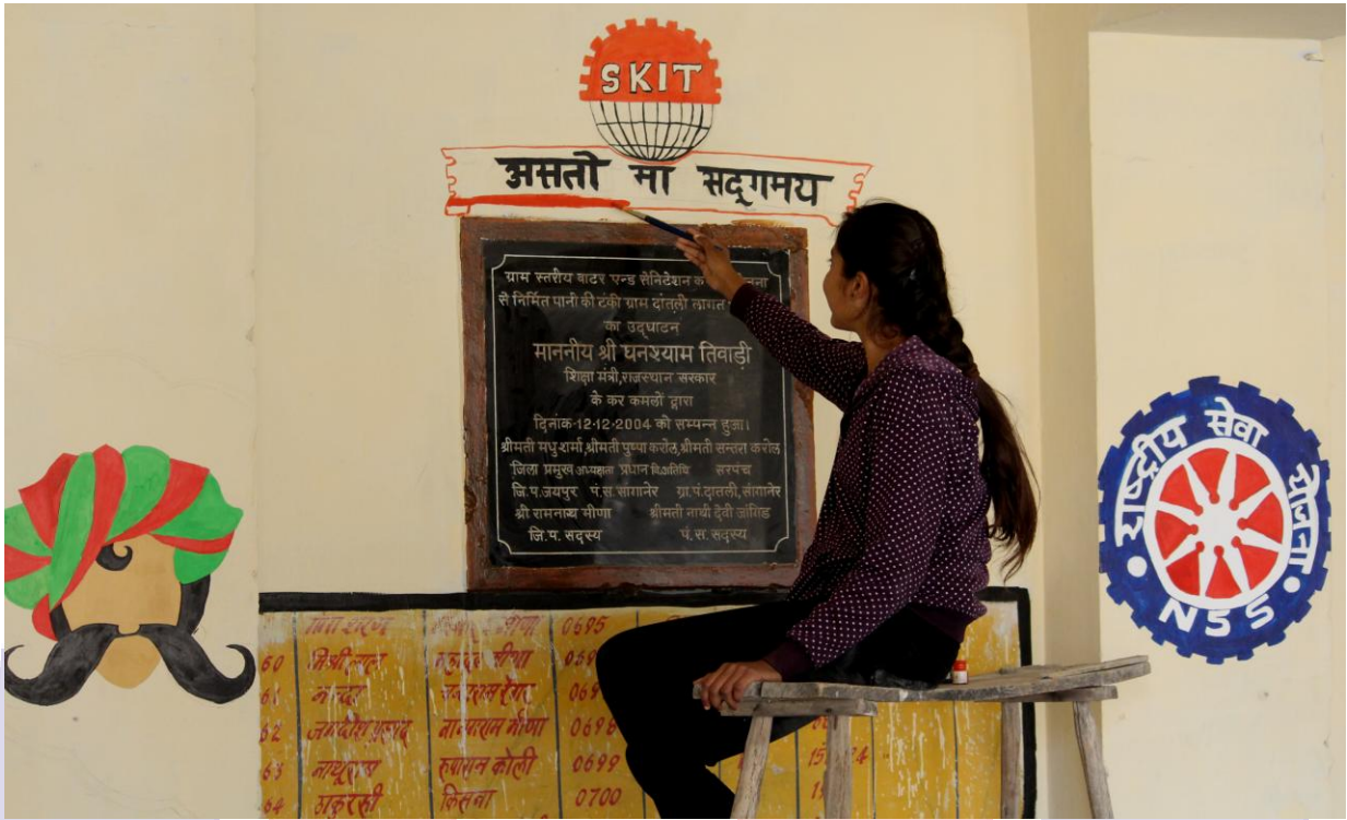
4.3C A Girl Volunteer Making Logo of SKIT during Camp