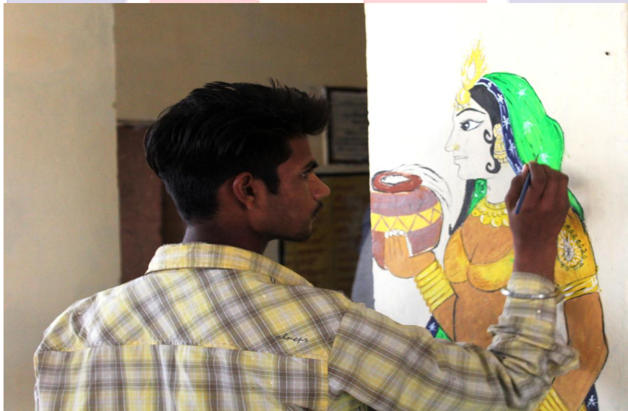
4.4C Wall Painting and Portraying Designs