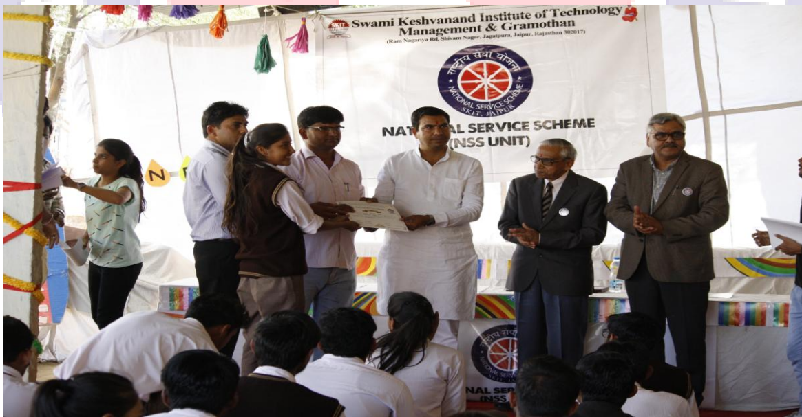
5E. Certificate Distribution Ceremony