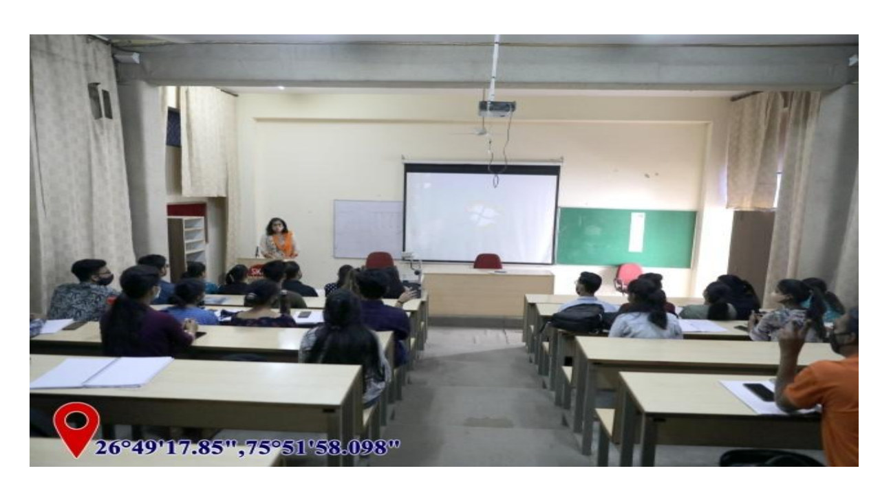
Kautilya Seminar Hall, Vishvakarma Block