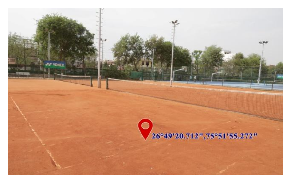
Tennis Court (Clay)