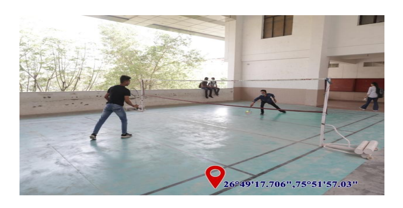
Badminton Court (M. Visvesvarayya Block)