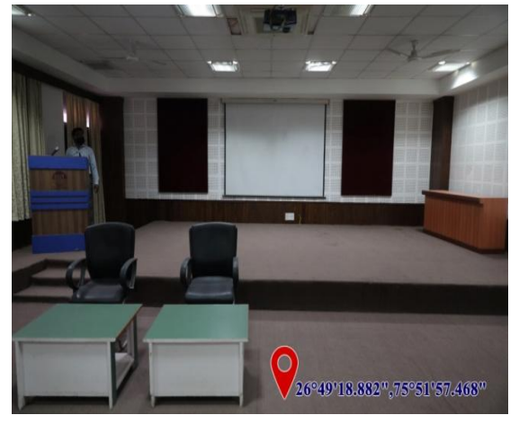
Meghnad Saha Seminar Hall, The Vishvakarma Block