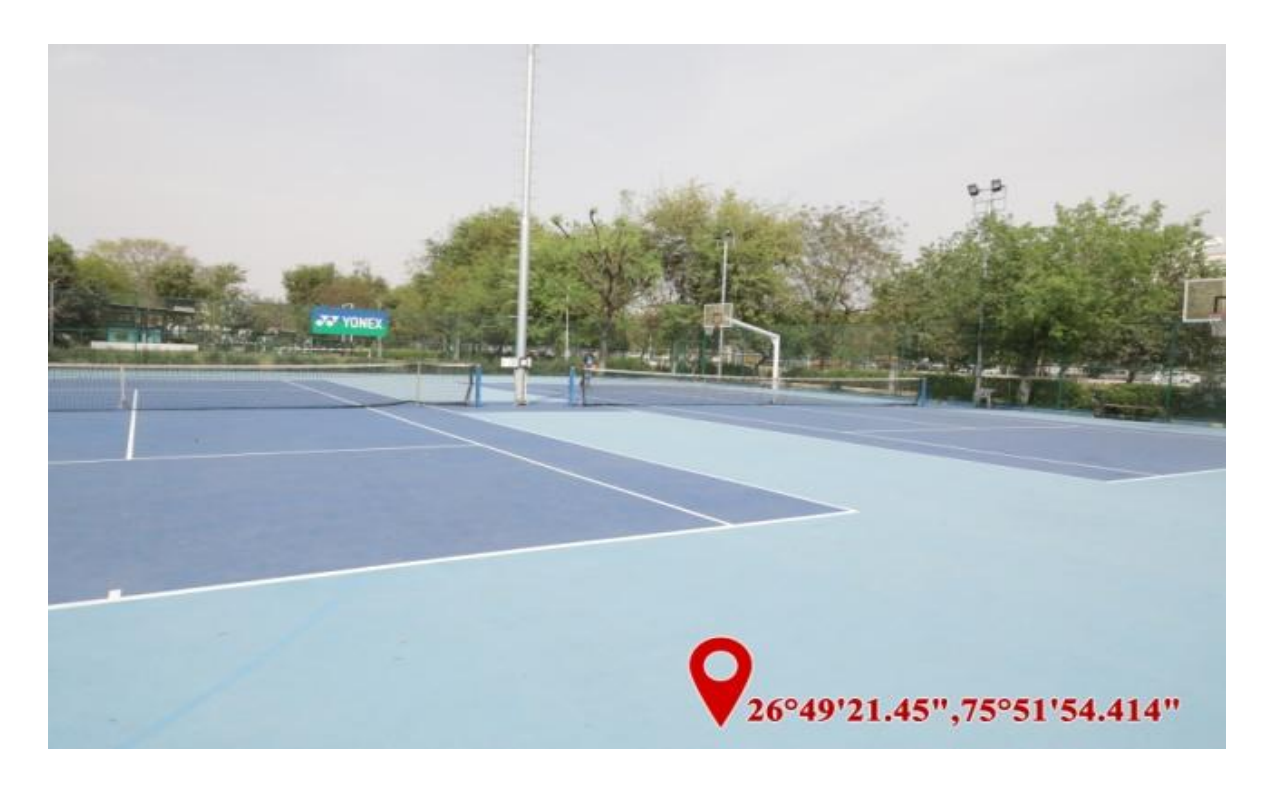
Tennis Court (Synthetic)/Basketball Ground (Synthetic)