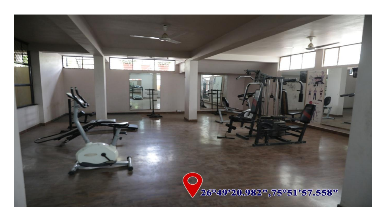
Girls Hostel Gym