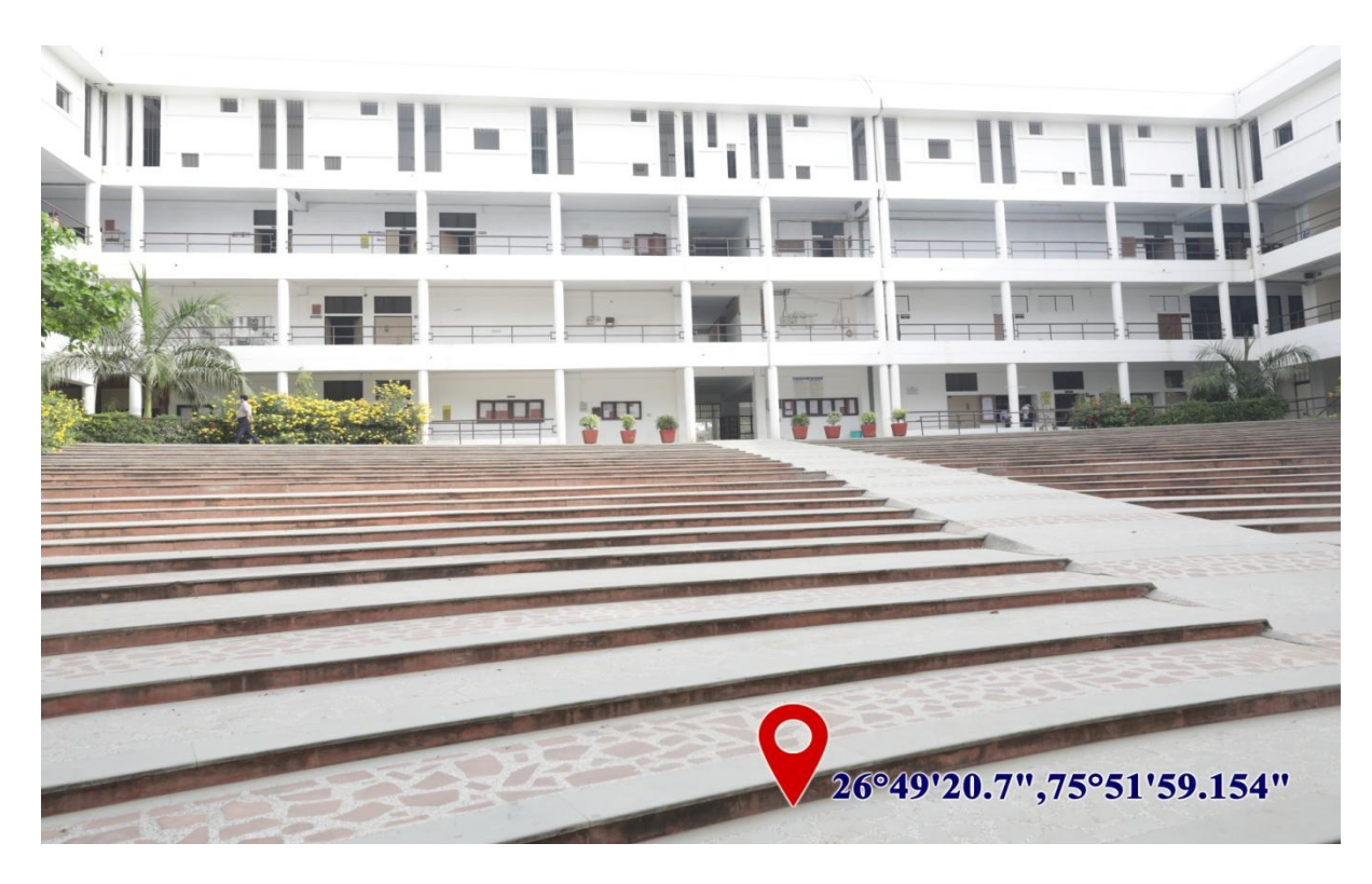
Amphitheatre (Vikram Sarabhai Block)