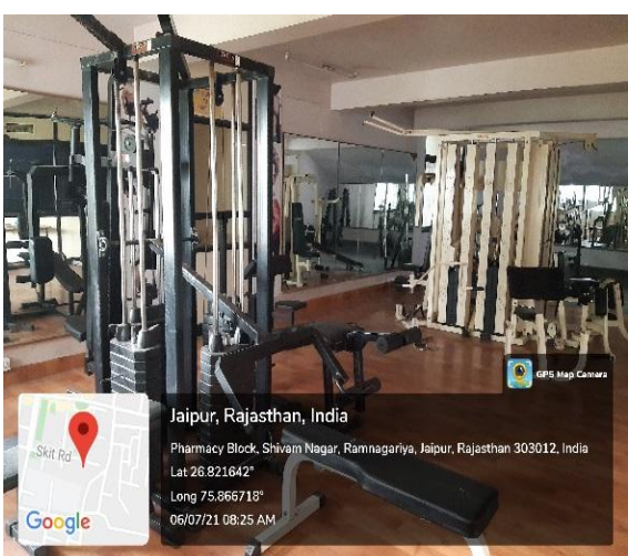
Boys Hostel Gym