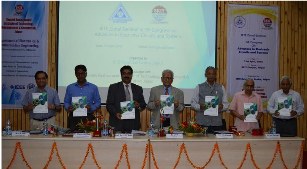
Unveiling of Souvenir of the technical papers