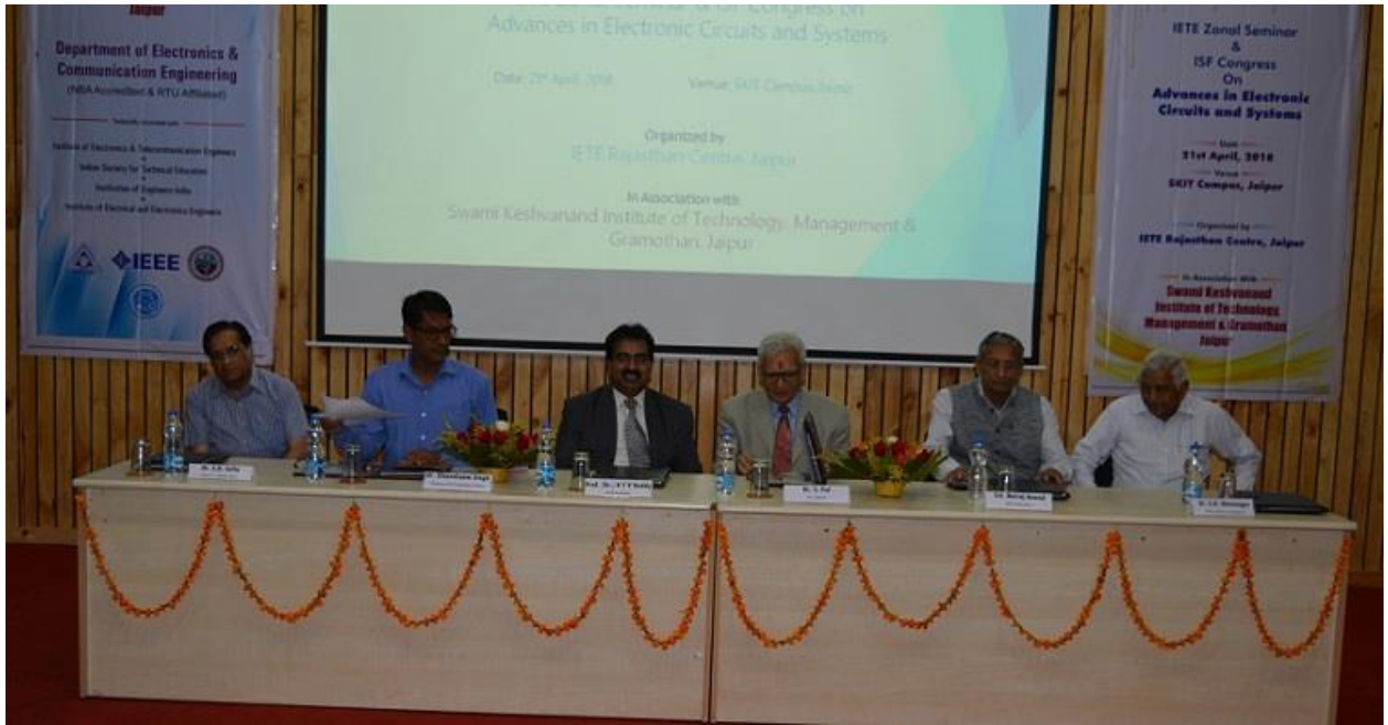
Inaugural ceremony of the seminar