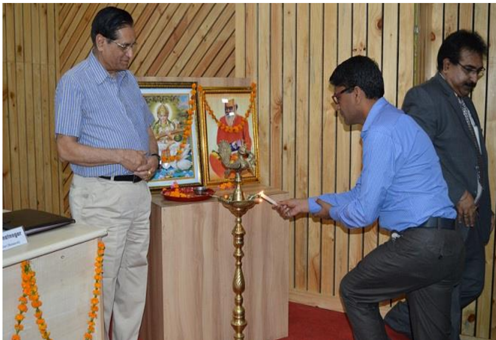
Lamp lightening ceremony of the seminar