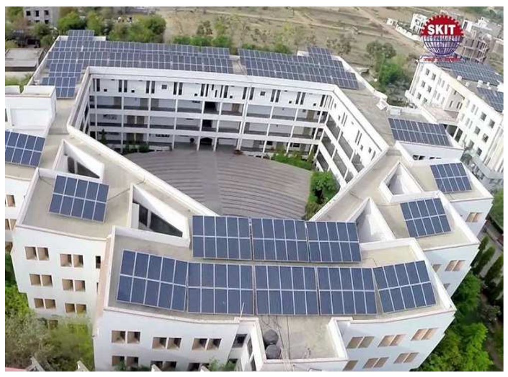
Aerial view of solar power plant