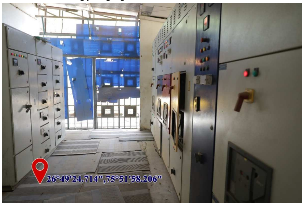
Sensor-based Backup Electric System