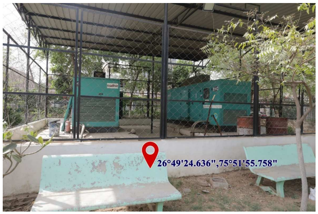
Sensor-based Backup Electric System