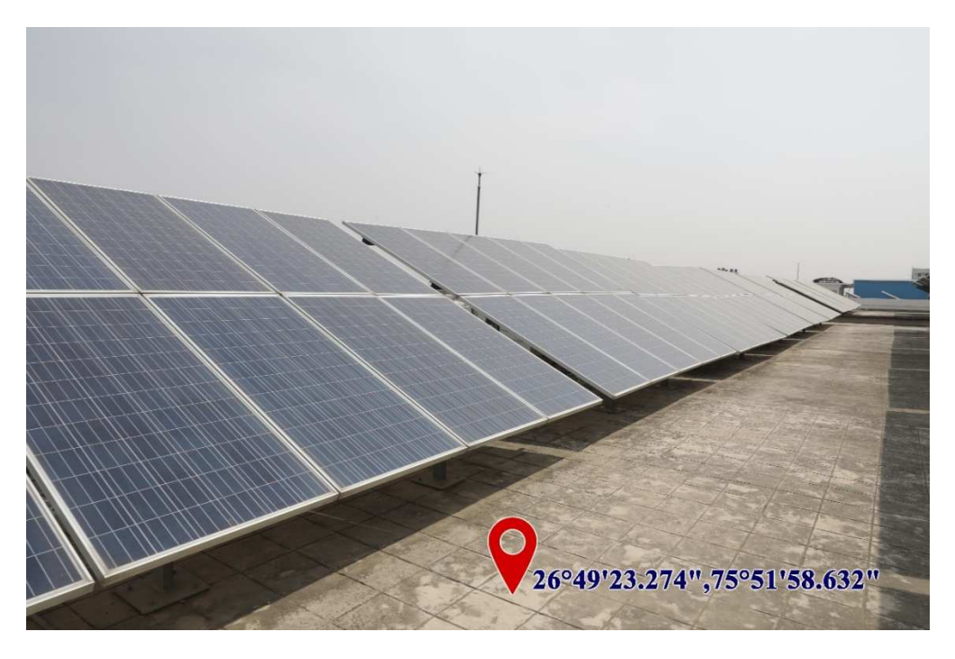
Geotagged Photograph of Solar Power Plant