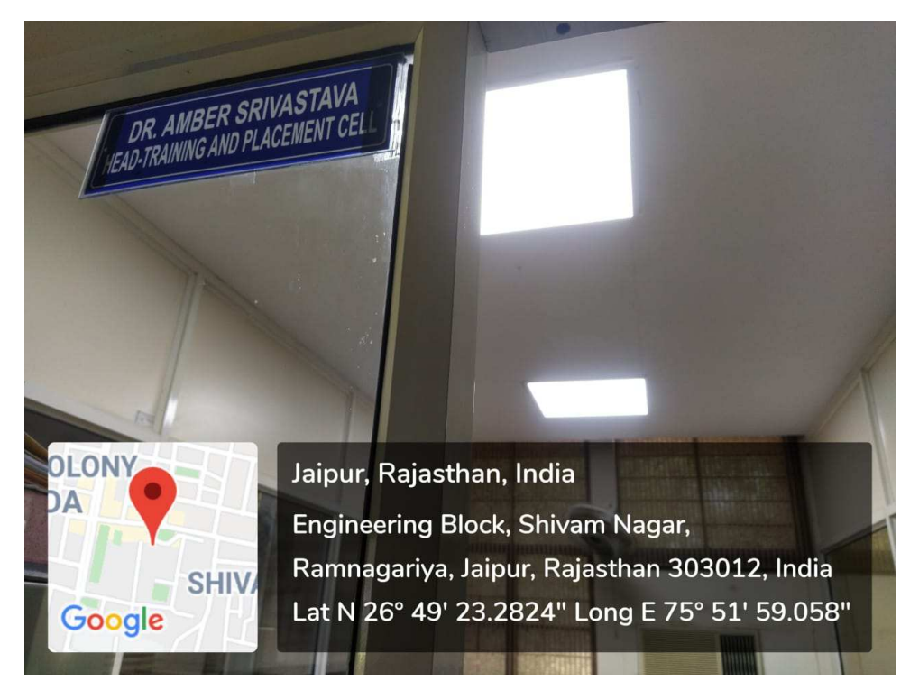
Use of LED Bulbs/Lights in Cabins