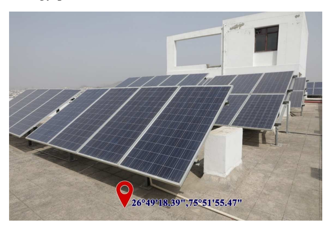
Geotagged Photograph of Solar Power Plant