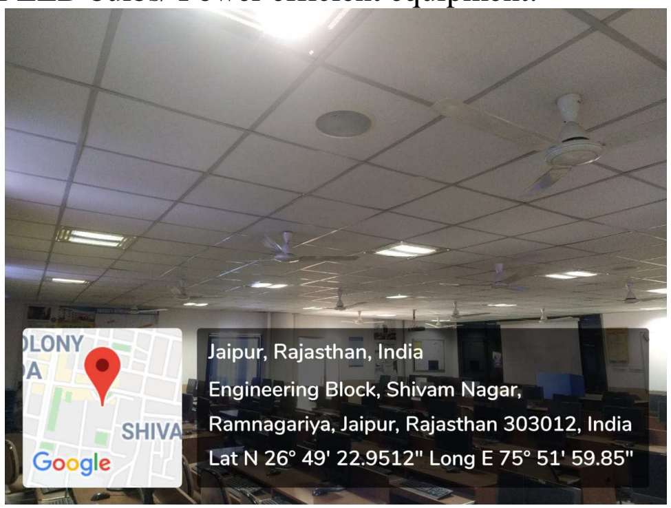
Use of LED Bulbs/Lights in Class Room & Labs

Use of LED bulbs/ Power efficient equipment:-