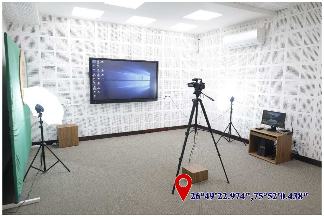
Use of LED Bulbs/ Lights in ICT-eSLATE