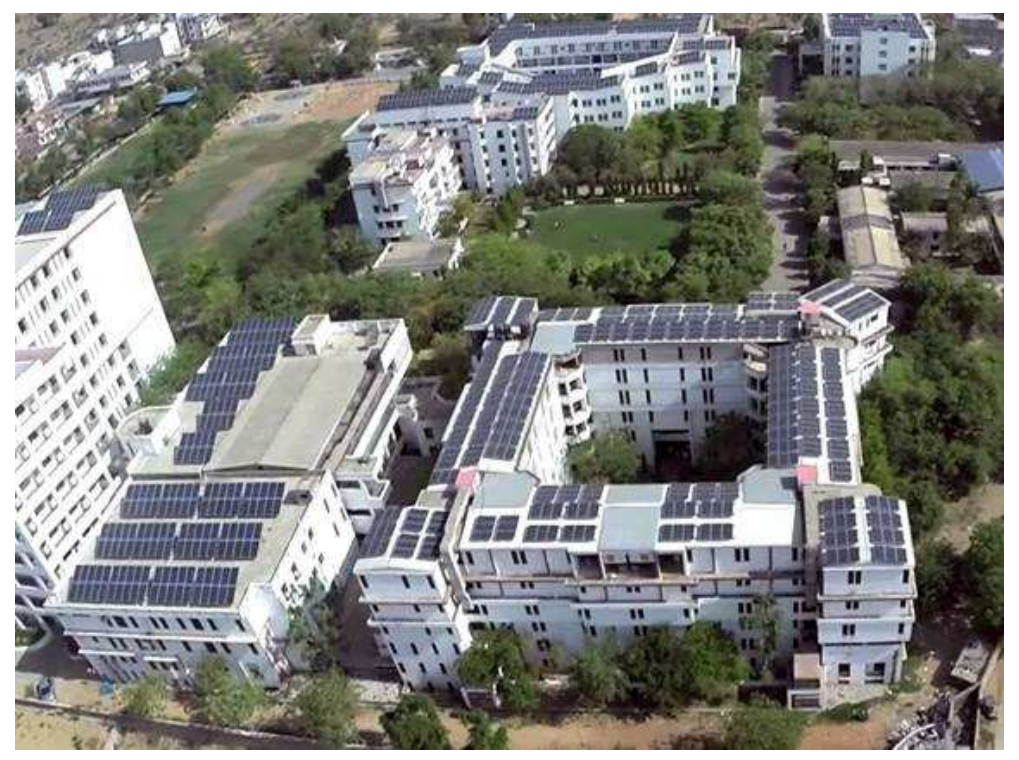
Aerial view of solar power plant