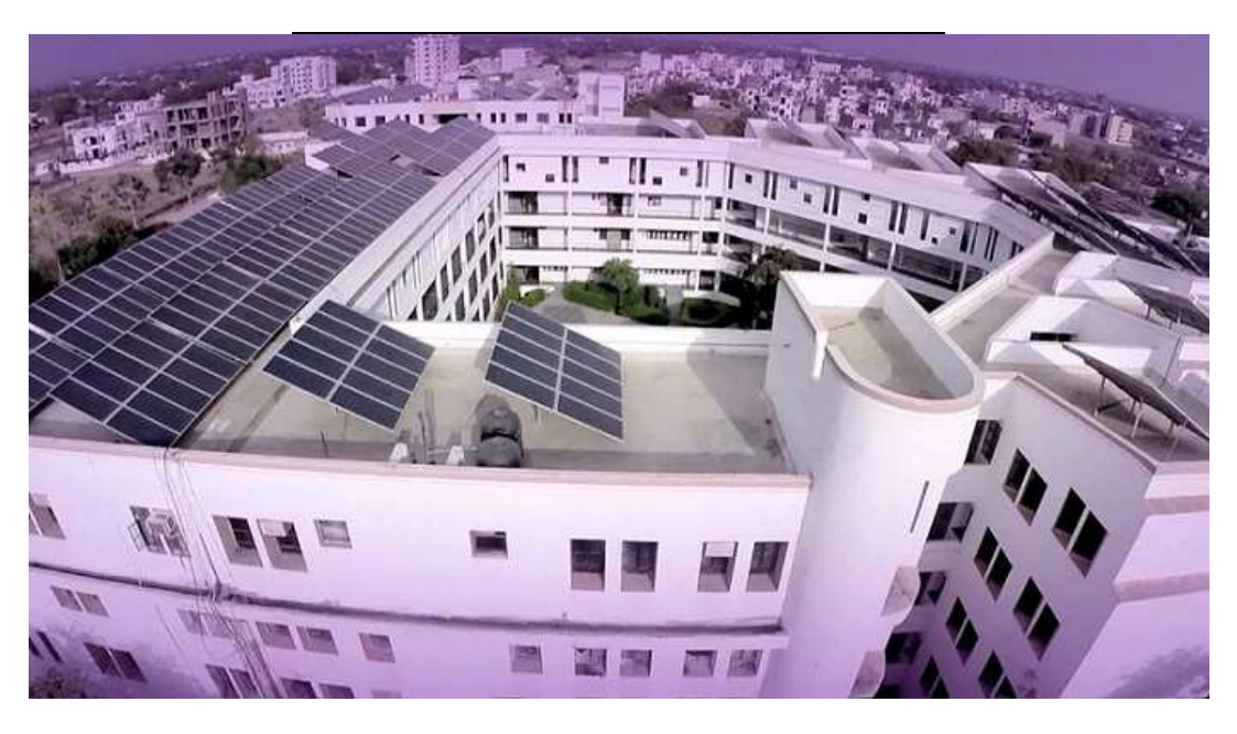
Photograph of Solar Power Plant