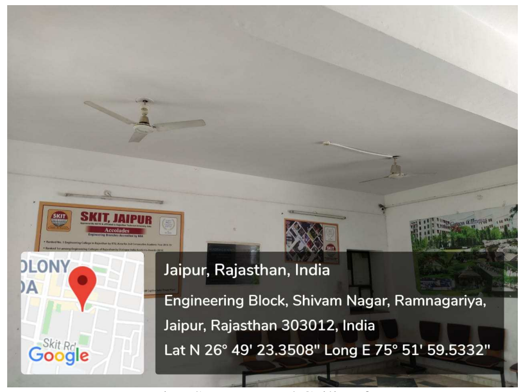
Motion Sensor Based Ceiling fans