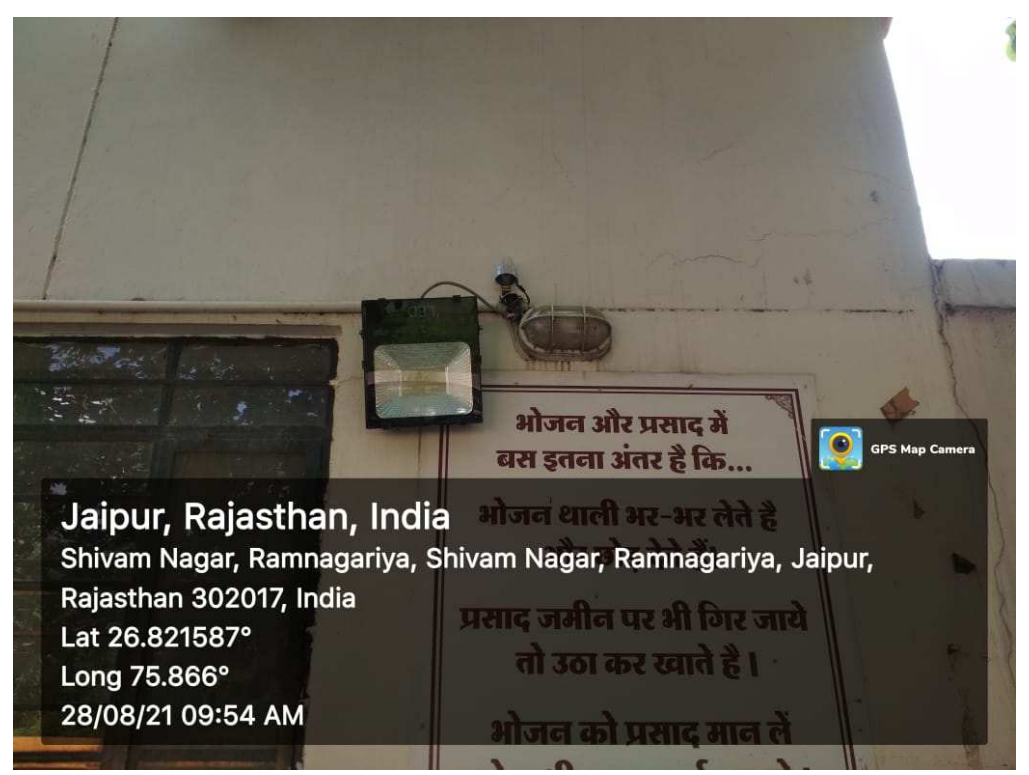
Sensor Based Street/Common light