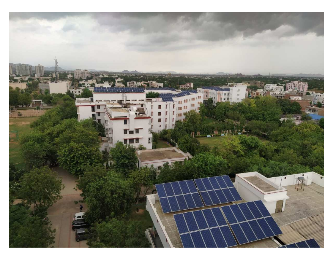
Photograph of Solar Power Plant