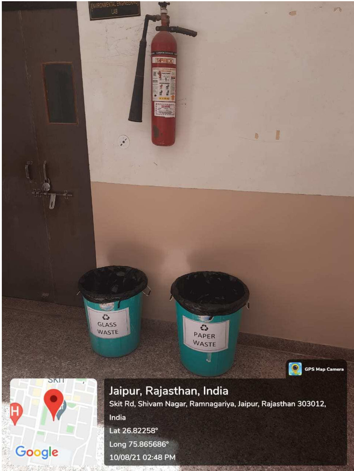
Waste collector in the campus

Affiliated to Rajasthan Technical University, Kota