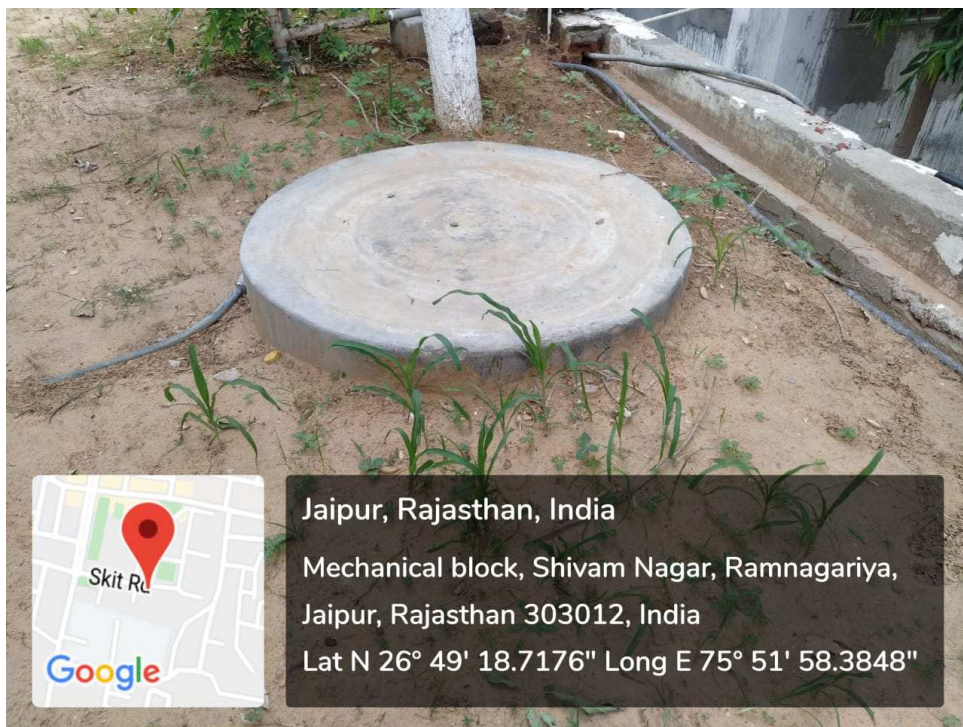
Liquid Waste Management System (Septic Tank)

📍: RAMNAGARIA (JAGATPURA), JAIPUR-302017 (RAJASTHAN), INDIA