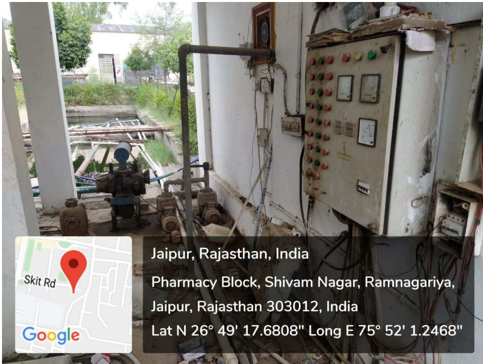
Waste Water Recycling Plant (Sewage Treatment Plants)

Affiliated to Rajasthan Technical University, Kota