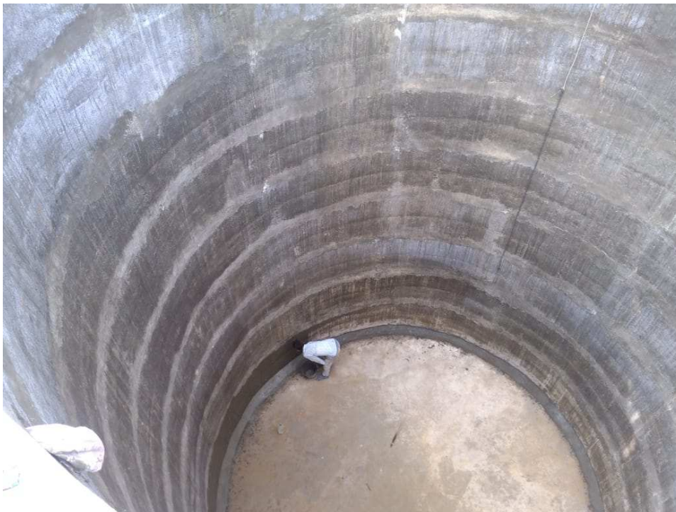
Water Harvesting System: Construction of Underground Tank

📍: RAMNAGARIA (JAGATPURA), JAIPUR-302017 (RAJASTHAN), INDIA