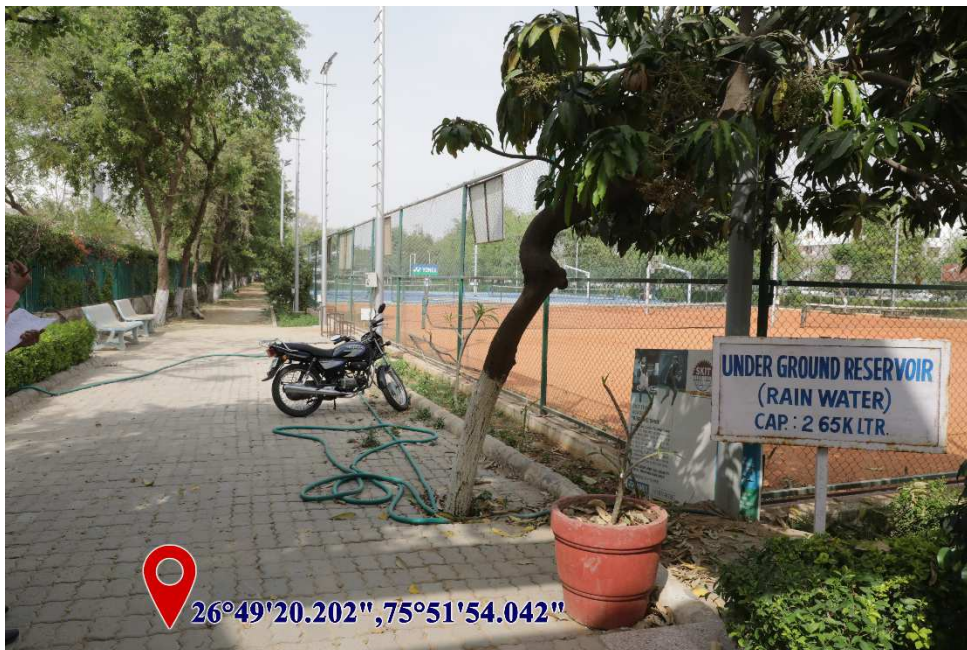
Geotagged photograph of Underground Tank

📍: RAMNAGARIA (JAGATPURA), JAIPUR-302017 (RAJASTHAN), INDIA