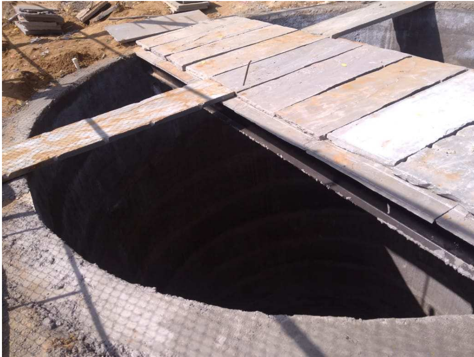
Water Harvesting System: Construction of Underground Tank

Affiliated to Rajasthan Technical University, Kota