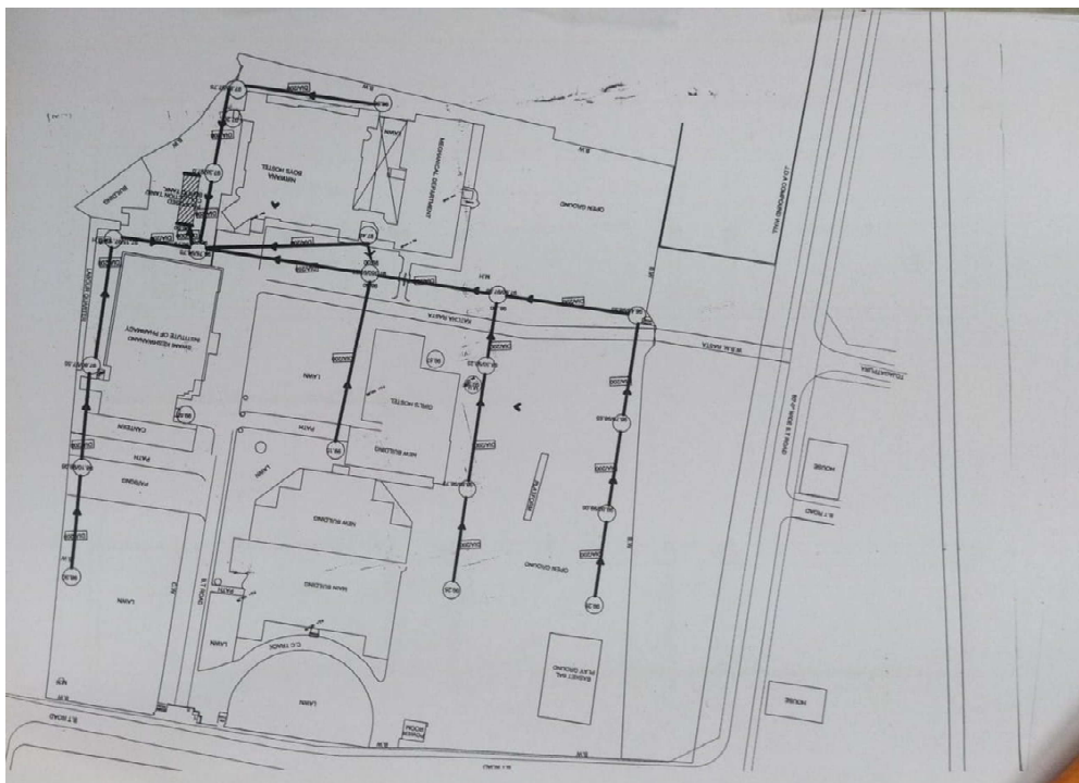
Line Diagram for Waste Water Recycling System in Campus