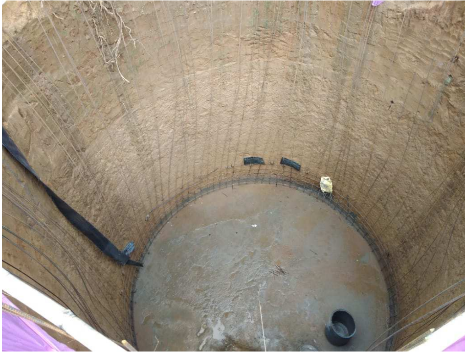
Water Harvesting System: Construction of Underground Tank

Rain water harvesting system/ Construction of tanks:-