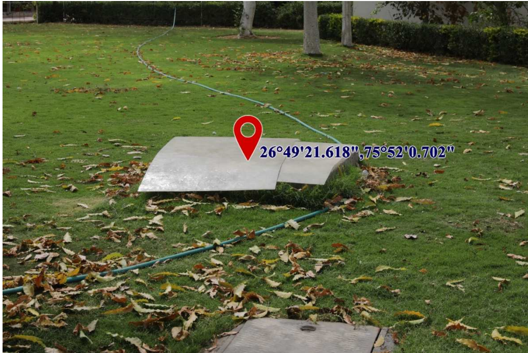
Geotagged photograph of Underground Tank

Affiliated to Rajasthan Technical University, Kota