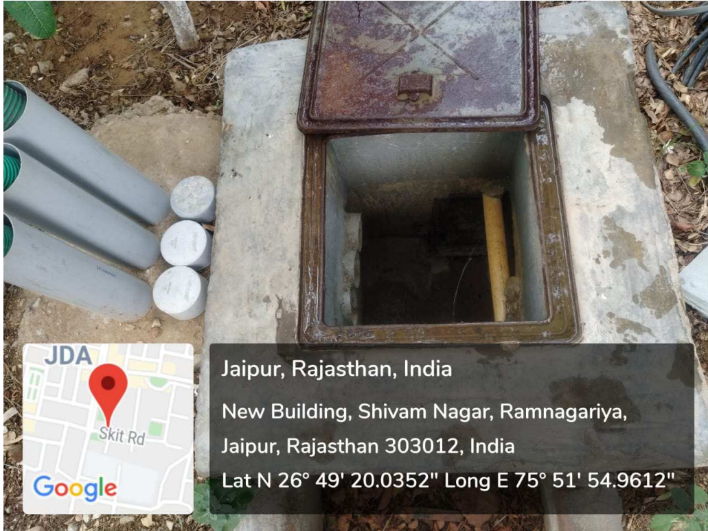
Water Harvesting System in the campus

Affiliated to Rajasthan Technical University, Kota