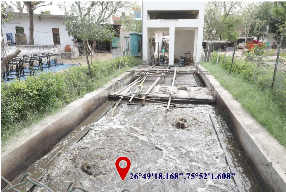
Water Recycling Plant (Sewage Treatment Plants)

📍: RAMNAGARIA (JAGATPURA), JAIPUR-302017 (RAJASTHAN), INDIA