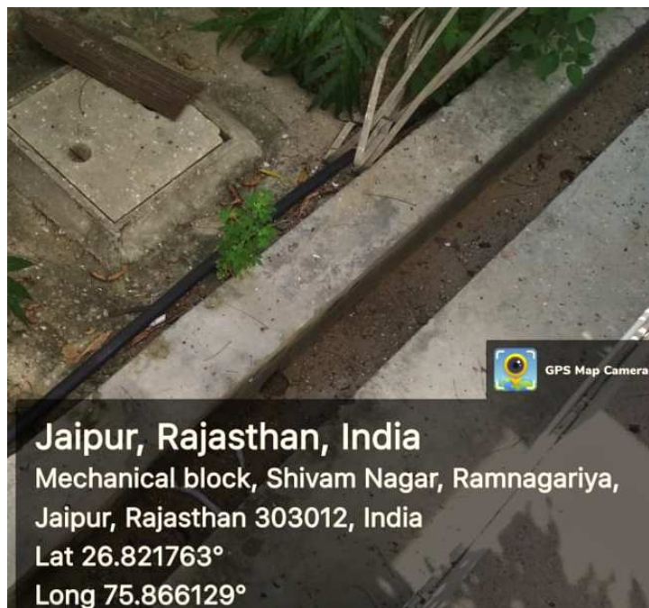
Borewell/Open well recharge

📍: RAMNAGARIA (JAGATPURA), JAIPUR-302017 (RAJASTHAN), INDIA