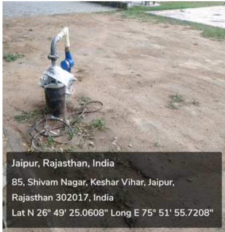
Bore well in the campus